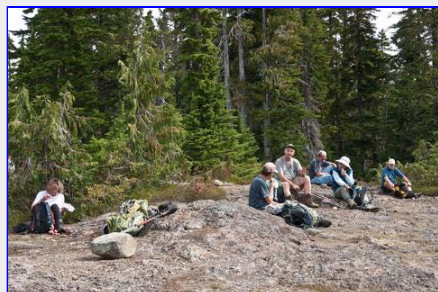
First coffee break