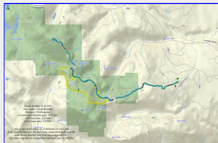
GPS Map