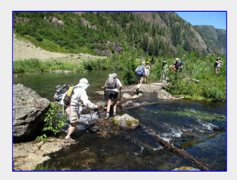
Stream crossing on our return