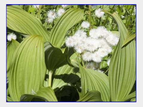
Flowers in the meadow above the lake