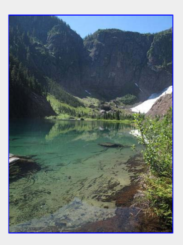
The Lake