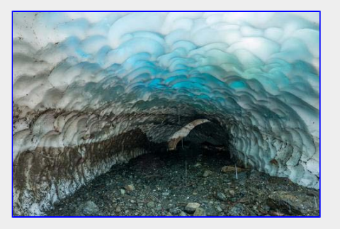
Light through the thin ice of the cave ceiling