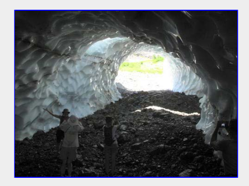
Enjoying the beauty