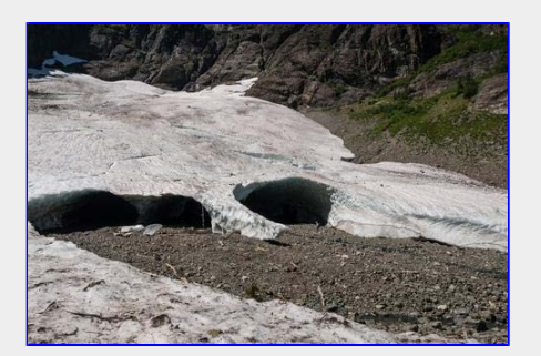
Looking into the cave entrances - Check the scale against the