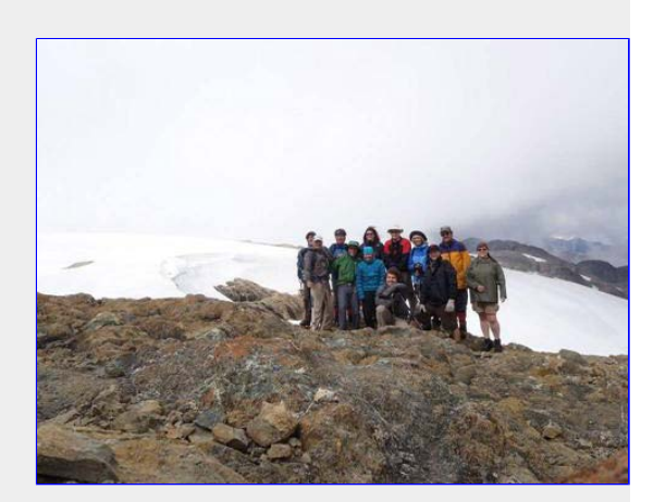
Group shot at the South Summit.