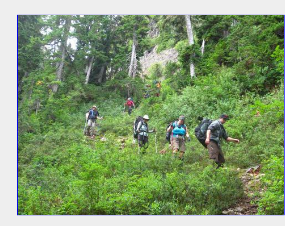
Monday coming down