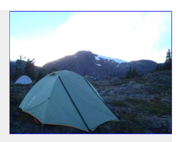
Sunday Morning