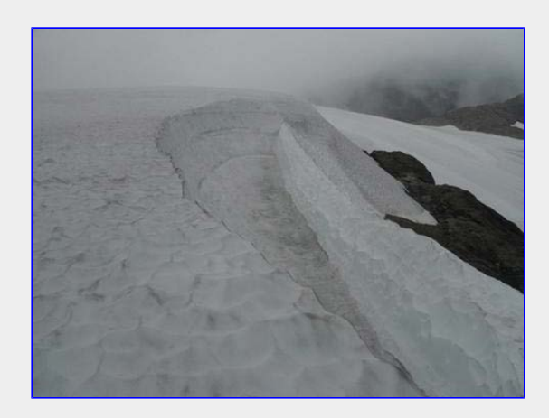
Ice is slowly breaking away