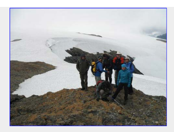
Part of the group at the South Summit.