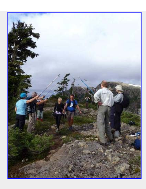
The wedding couple coming thru on Sunday morning.