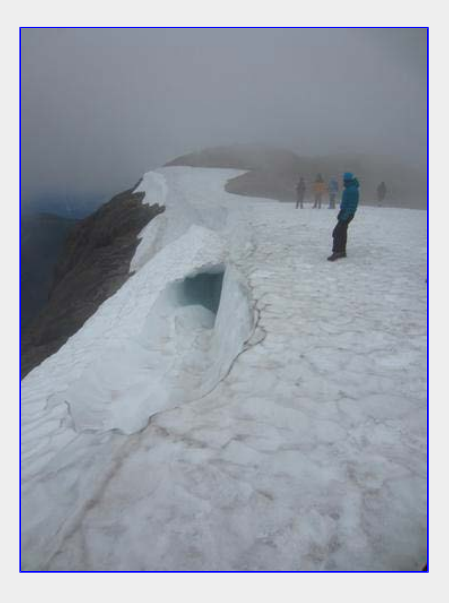
At the glacier looking towards the South Carin