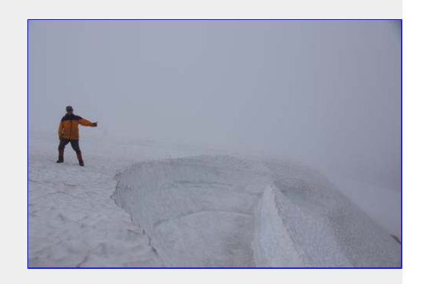
Kenny, our Amazing TL - Thanks