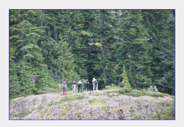
Not the Picture I wanted - So cute..