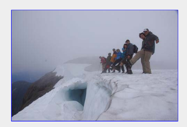
Noooooooo, don't step there.....