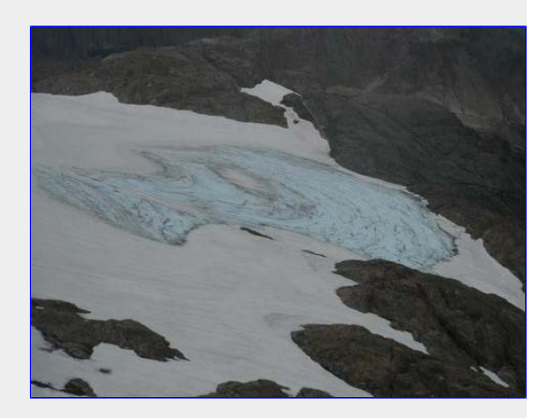
Solid Blue Ice on the glacier