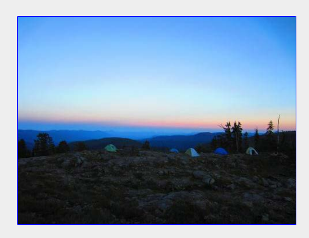
Sunset at Camp Saturday night