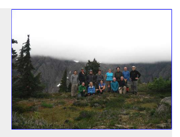
Group picture at the tenting area. Yes, the glacier is somewhere behind those clouds !!!