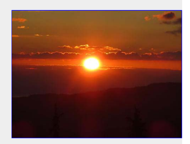
Sunrise Sunday