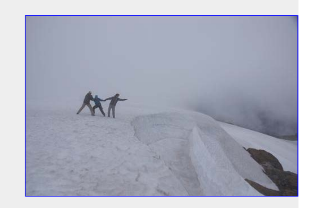
Please Dodo, don't even think about it :)