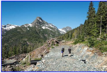
Start of the hike