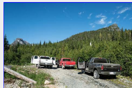
On the road in. George V on the left and Castlecrag on the right