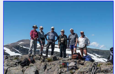
Group shot on the summit