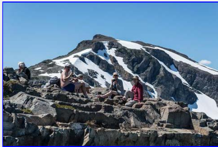
Lunch break on the summit