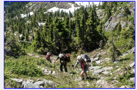
Nearly onto the summer trail