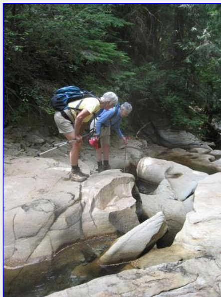
perservance creek