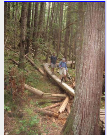
walking the logs