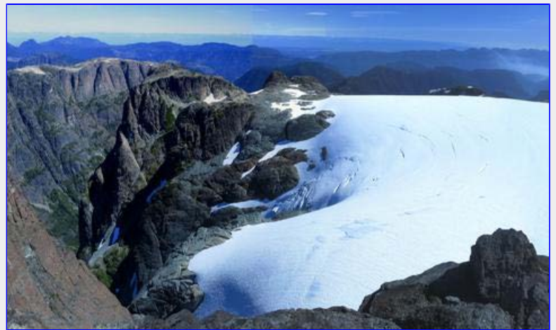
A view towards town from the North summit