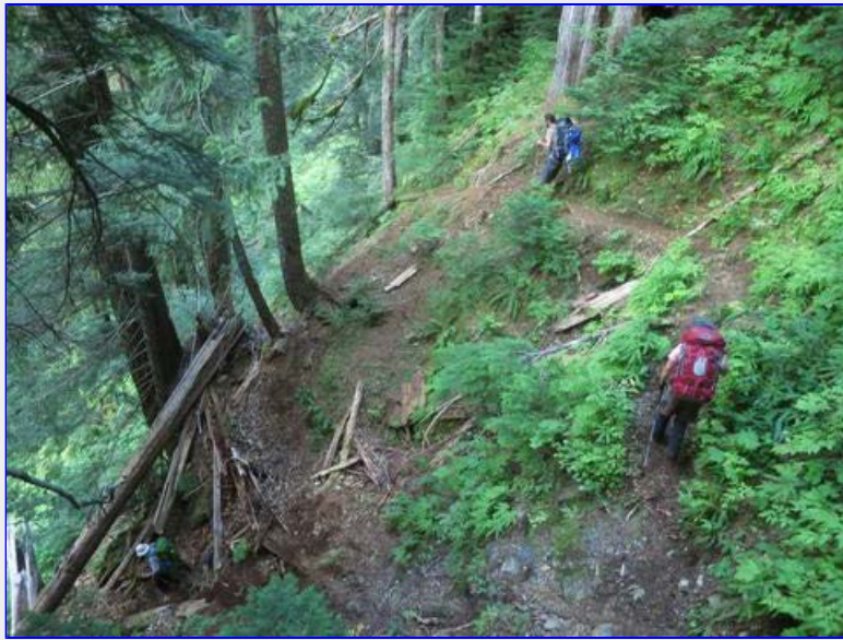
The long way down