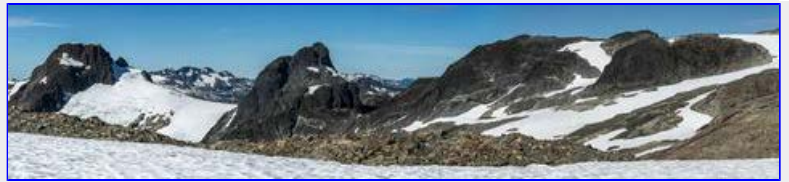
Panorama shot of The Red Pillar and Argus Mountain