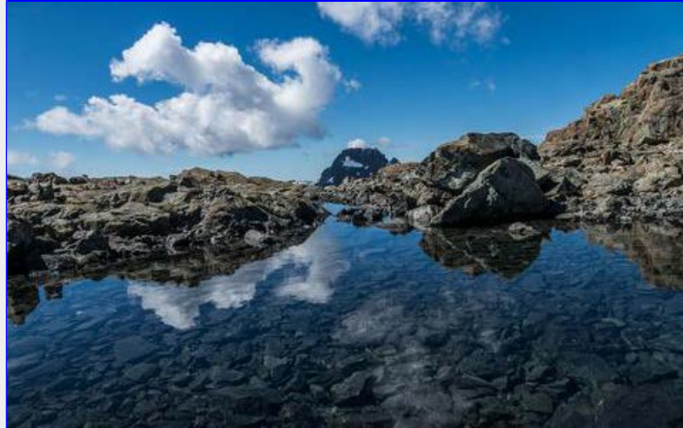
A good spot for filling up our water bottles on the way back across the glacier