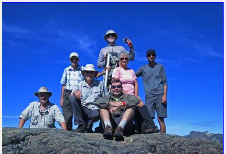
The mandatory summit photo