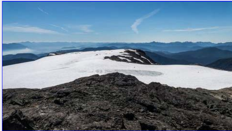
Some smoke in the valley below