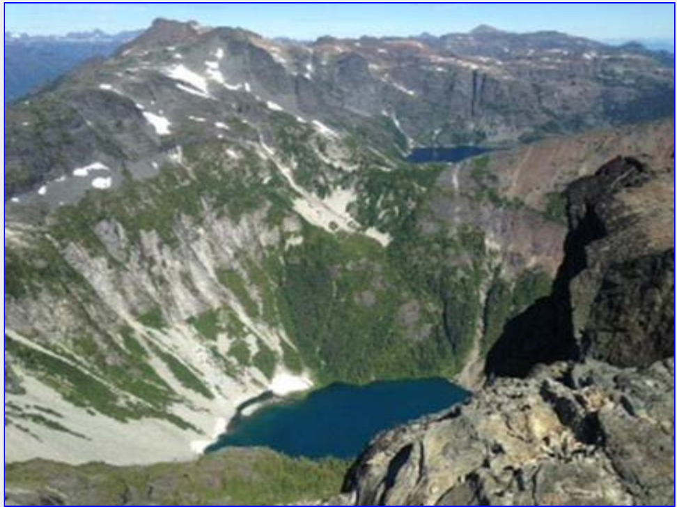
Mirren Lake