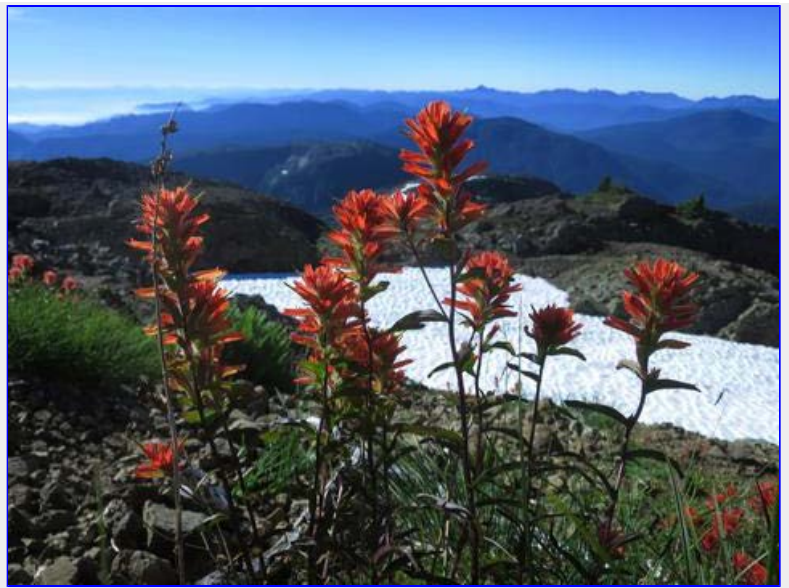
Paintbrush in full bloom