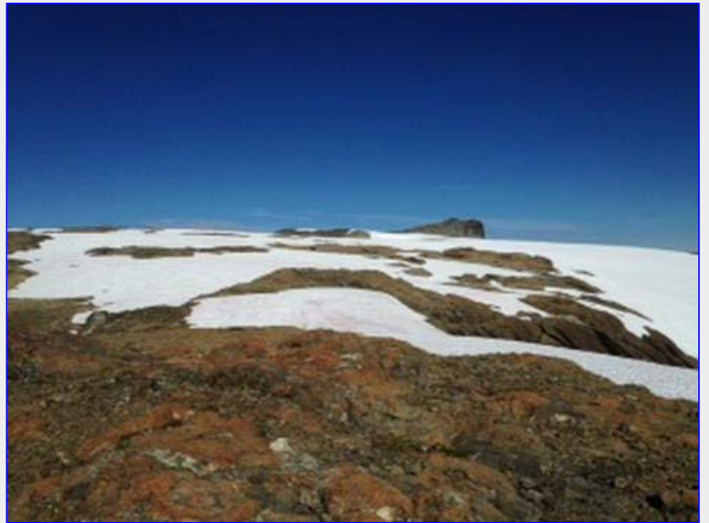
The ever thinning glacier from South Summit