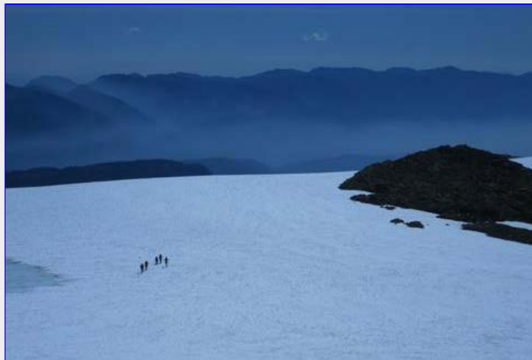
Return journey