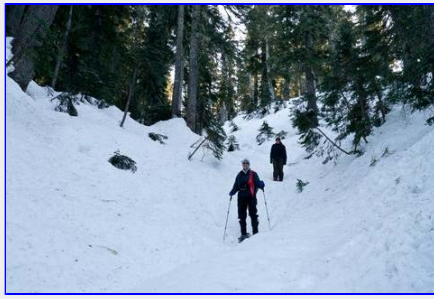
Heading down the gully to Helen Mackenzie Lake