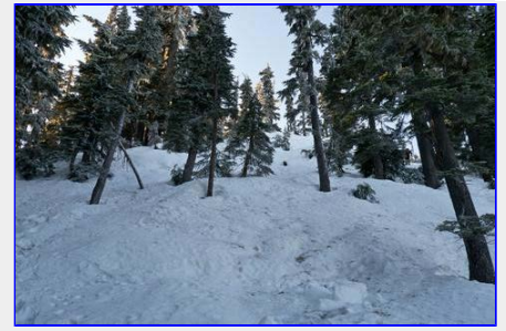
Last bit of the steep climb up to Mount Elma