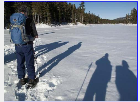
Day's end at Lake Helen Mackenzie