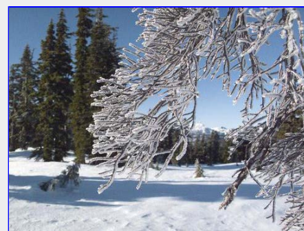
Frost at the start of the day