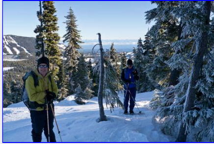
Just above the steep climb