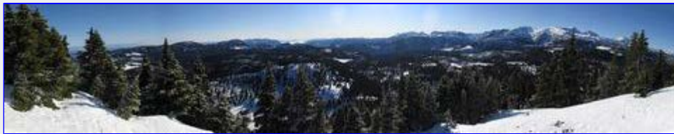
View from the top