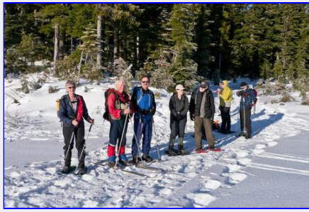
At the North end of Battleship Lake