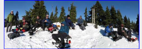
Lunch at the top