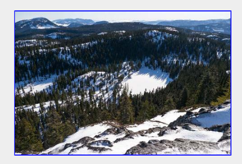
View down to Ball Lake from a rocky bluff on the Croteau Ridge