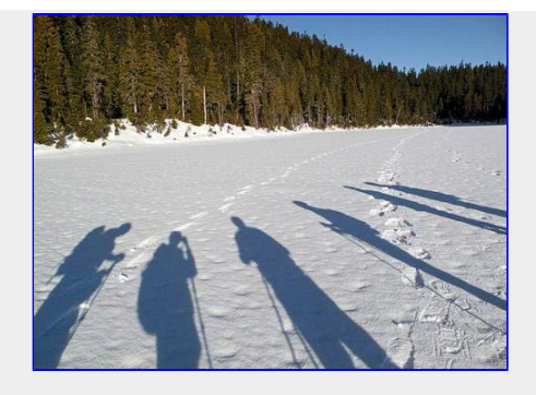
Group photo at Lady Lake