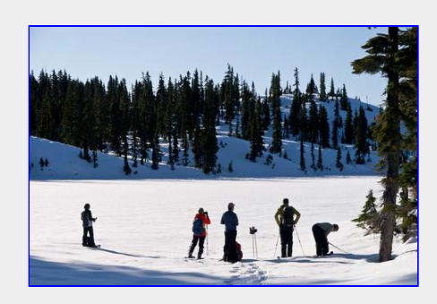
Just arrived at Croteau Lake [Tim Penney photo]

At the north end of Lady Lake [Tim Penney photo]