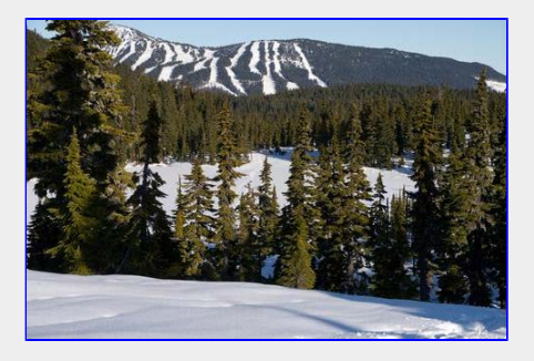
Looking back across Croteau Lake from the ridge