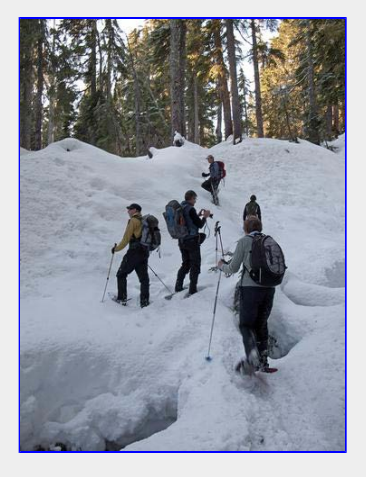
Snowshoers in the gully