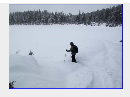
The snow was deep across Lake Helen Mackenzie