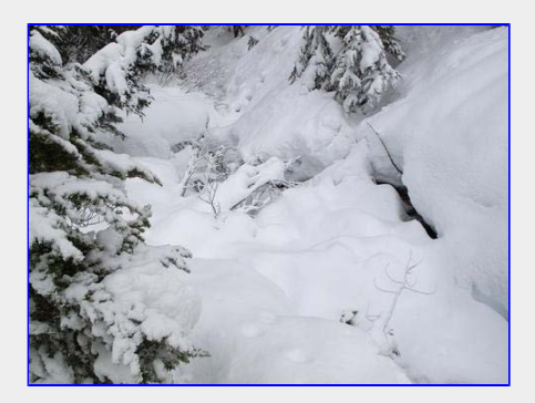
Gops of snow everywhere!