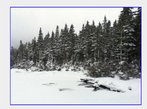
Open water on Lake Helen Mackenzie near Piggot Creek (taken with my iPod)