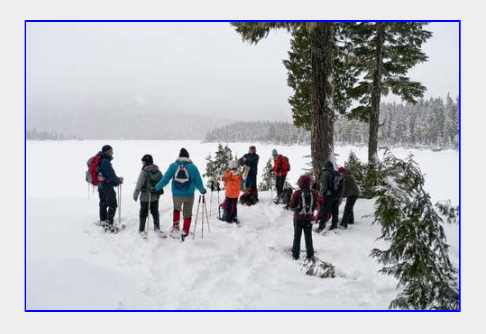
Lunch Break spot just above Lake Helen Mackenzie