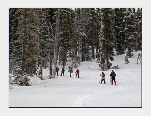
Into the woods we go