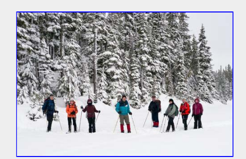
Outward bound on Battleship Lake