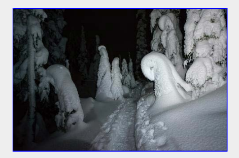
Headlight illumination on the trail above the meadows