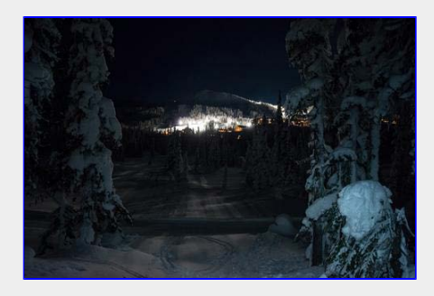
Just above the meadows and looking at the ski hill