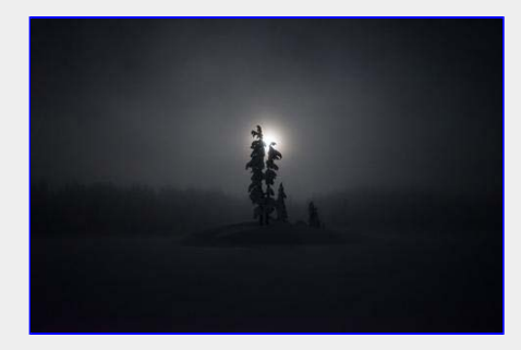
The moon was still diffused behind a veil of fog