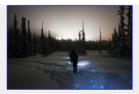
Heading through the meadows -Lots of light from the ski hill