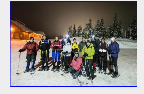
Group shot at the Raven Lodge parking area at the start of our trek