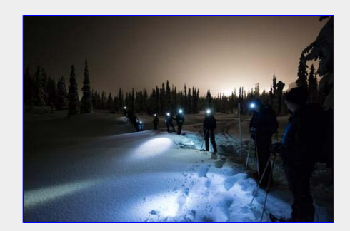
Still in the meadows