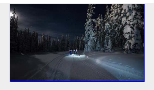
Moonlight and stars as we head back to the Raven Lodge