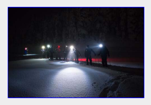
Lights on the lake