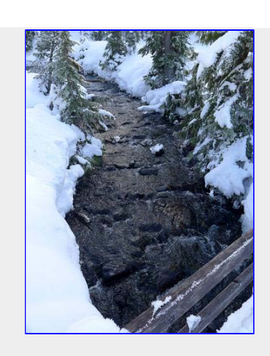
Piggott Creek