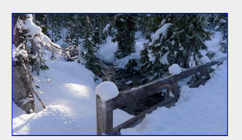
Nice lighting crossing Piggott Creek Bridge