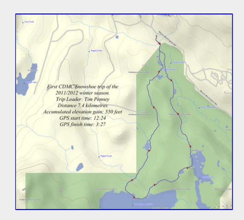
GPS map

It was a very pleasant and relaxed trip that, I hope, was enjoyed by all who turned out.