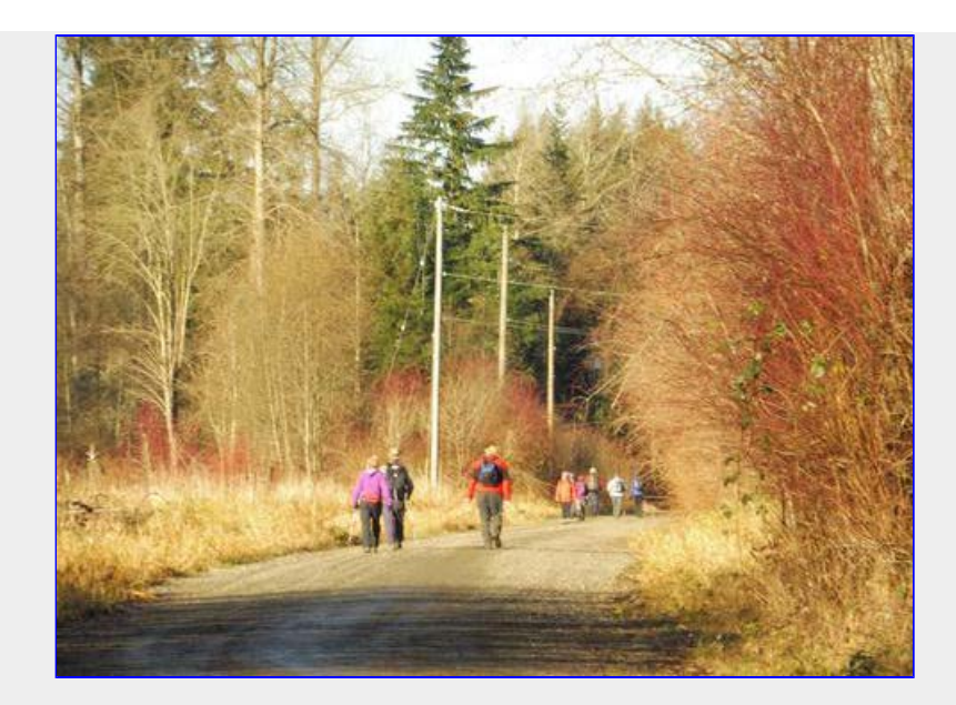
warm colours on a cold day