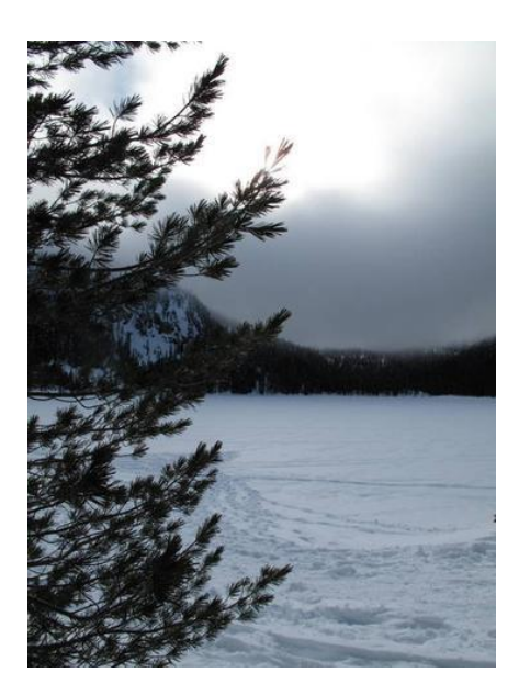
Sun breaking through at Helen McKenzie