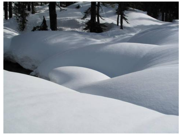
Piggott Creek Area