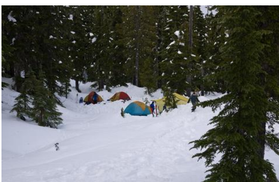
Campers at North end of Battleship Lake