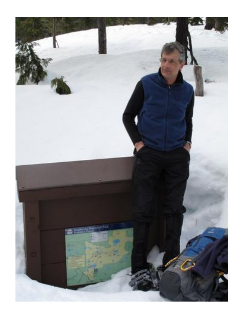
Hard to see the map at this level!