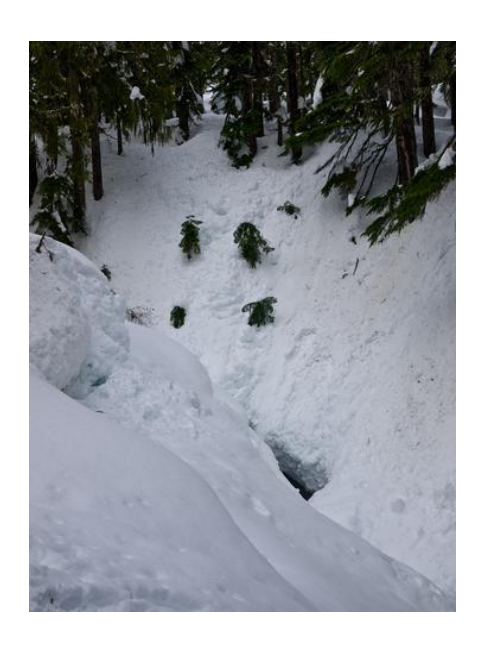
Following the creek up to Croteau Lake