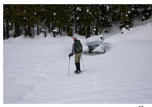
Geoff at South end of Lady Lake