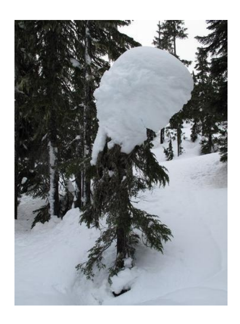
Heavy load for small tree