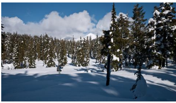
Looking towards Piggott Creek bridge with Mount Washington in the background