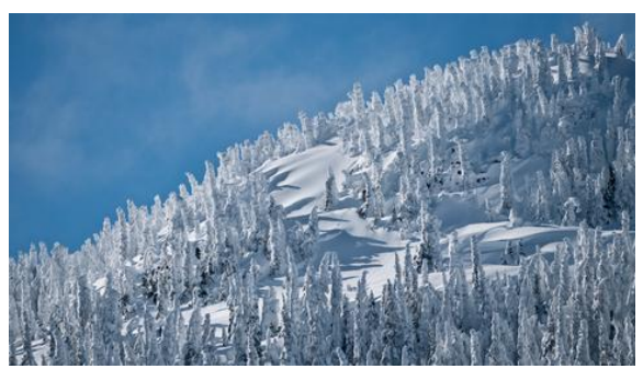
A lot of snow on Mount Allan Brooks