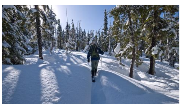
Geoff breaking trail in Paradise Meadows