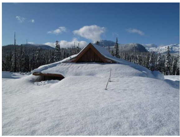
Summer information lodge almost completely covered