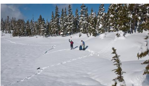
On Helen Mackenzie Lake