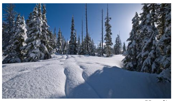
Heading out from Paradise Meadows