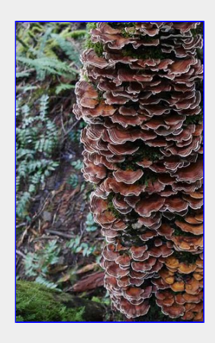
Wall of splendour