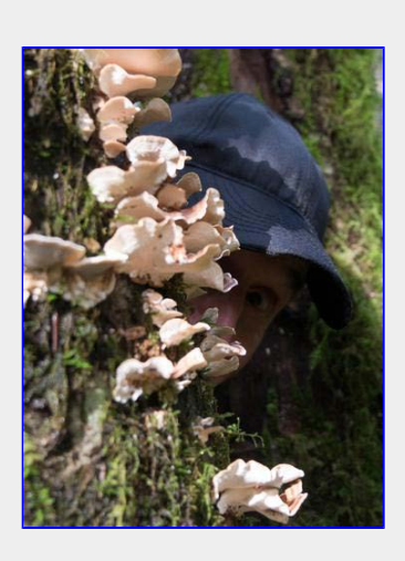
Woodland gnome peering out from the trees