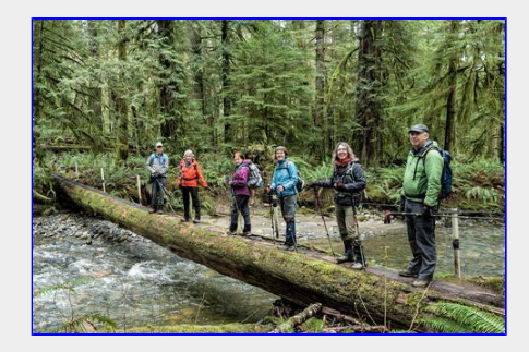
Crossing Nile Creek