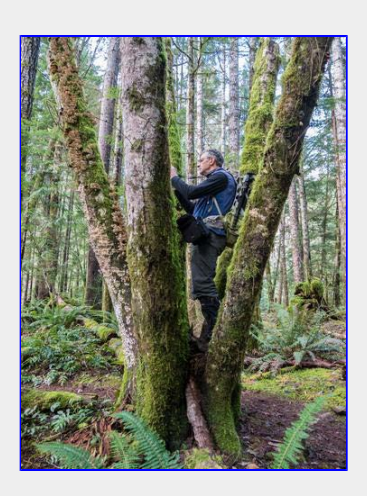
A well balanced act