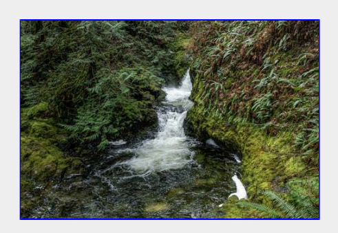
One of the lower falls