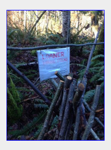
Nile Creek enhancement stands behind their work