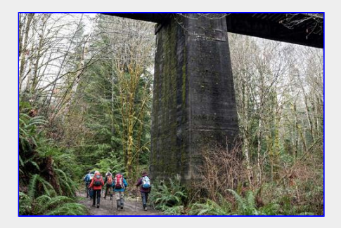
Under the railway line at the start of the trip

A nice outing which covered new terrain for most on this trip.