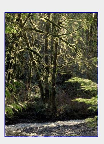
Forest Wonder