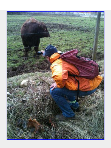
This is My Best Side.