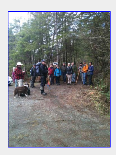
Saturday Strollers at Tsolum Trailhead.

We probably exceeded the advertised 6km distance. No GPS tracking completed, but maps of the Tsolum Spirit Park and surroundings are available as PDF files on the Comox Valley Regional District website.