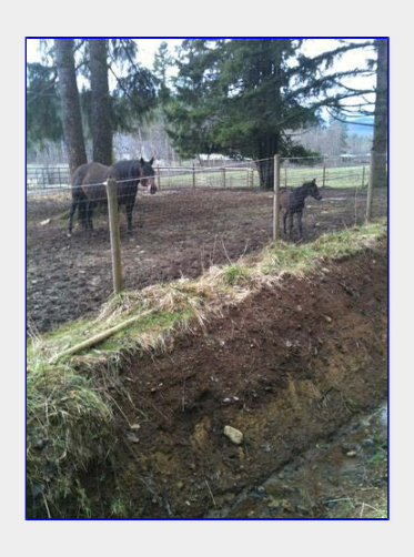
Spring is in the Air.