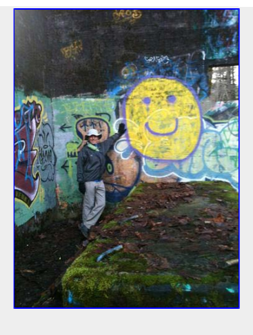
Smile a Little Smile at Headquarters.