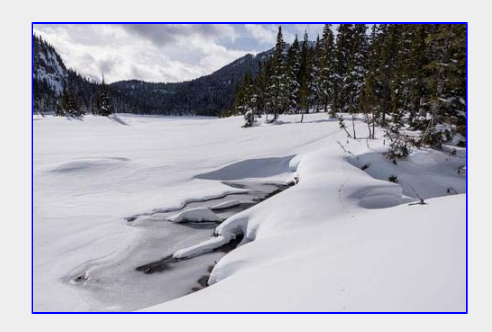
Piggott Creek Outflow from Helen Mackenzie Lake