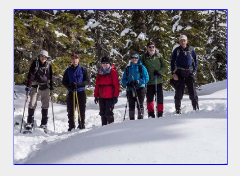
Kooso Klan