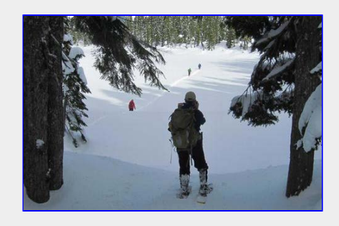
The view from above