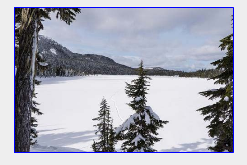
The Following Trail on Helen Mackenzie