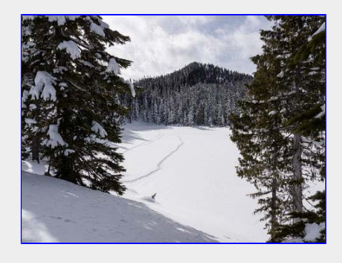
A Look Back to Kooso below NE Ridge of Elma