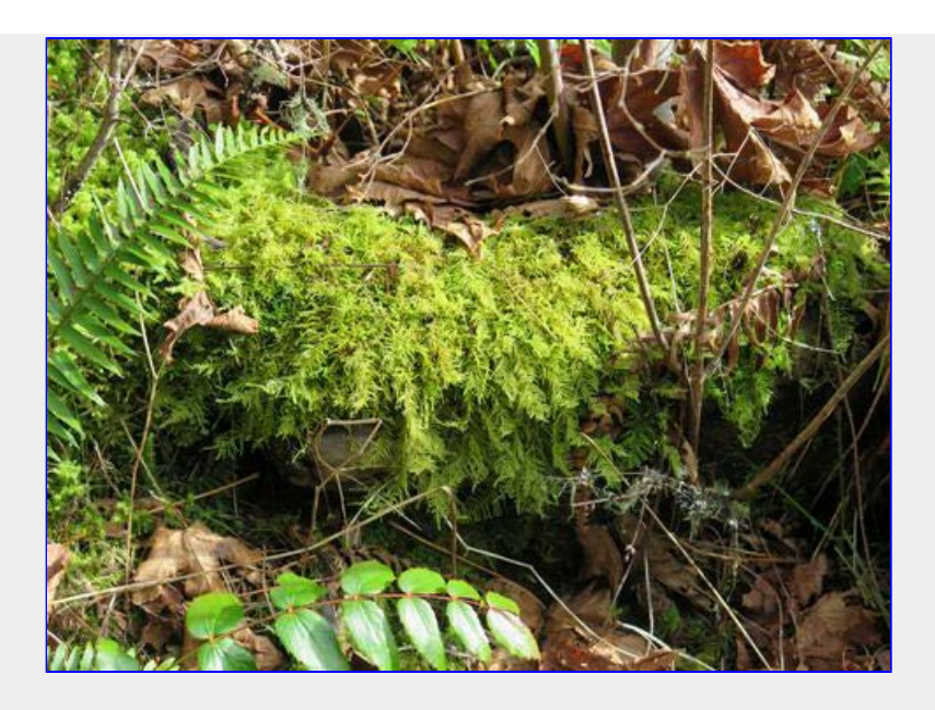
so much beautiful moss