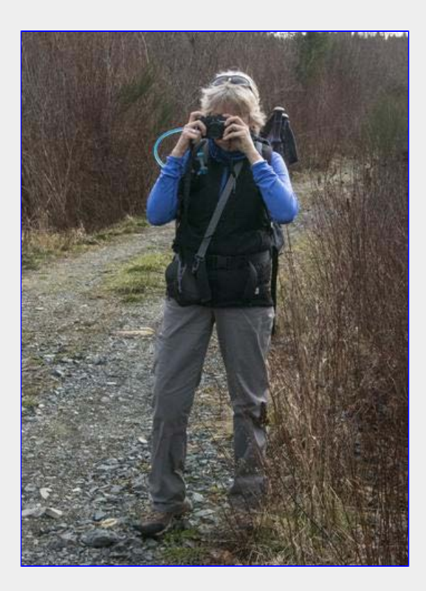
Taking the Group Photo