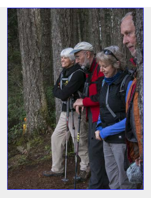
See any fish in the river?