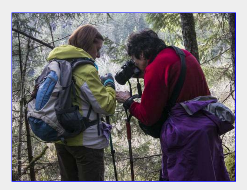
Macro Stuff