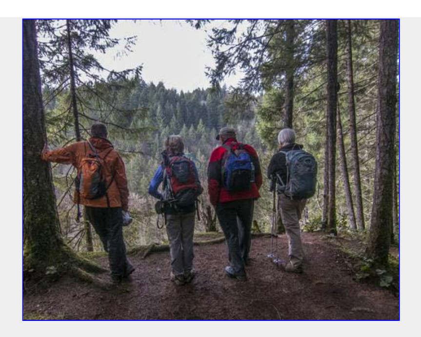
Don't step any closer!