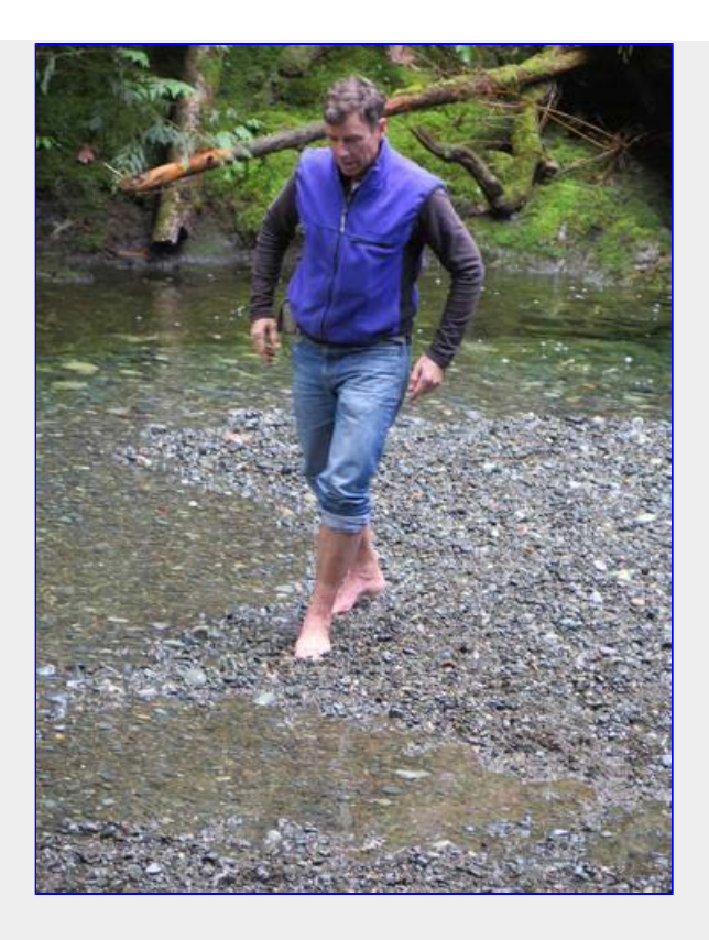
our leader dipping his feet