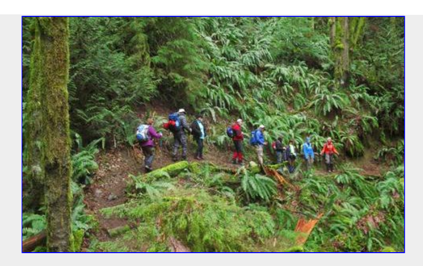
another photo of the group