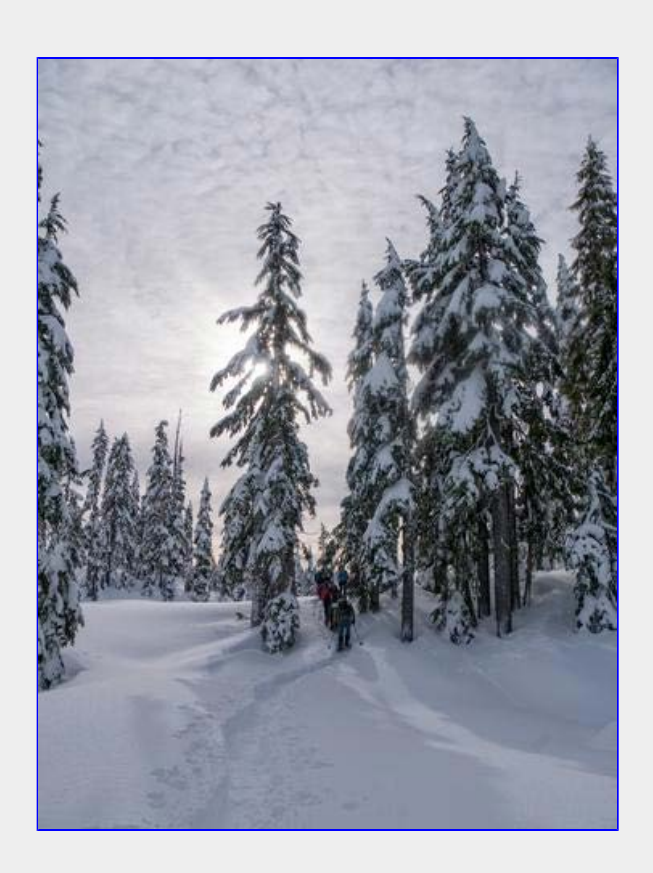
Approaching Battleship Lake