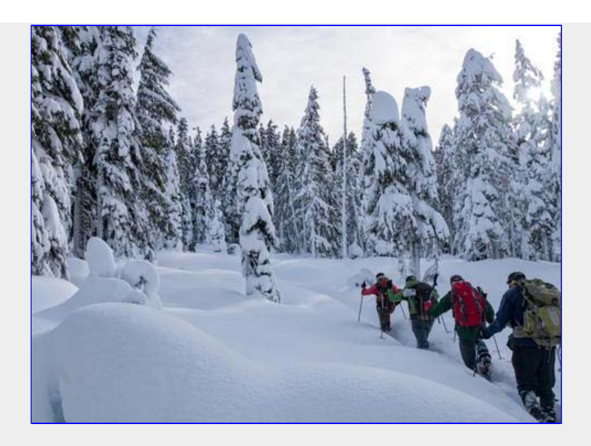
More trail breaking