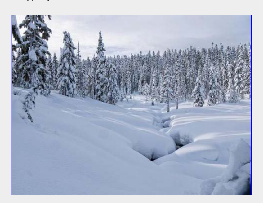
So much snow