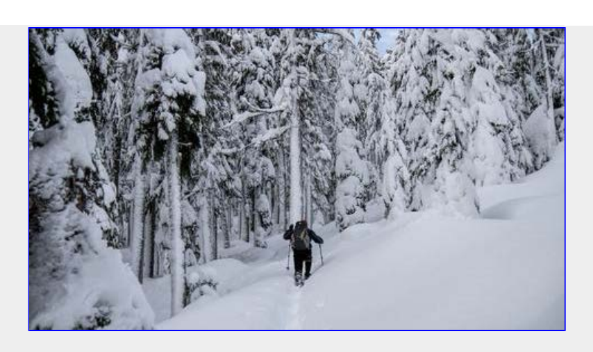
Joe breaks trail as we head out from the meadows