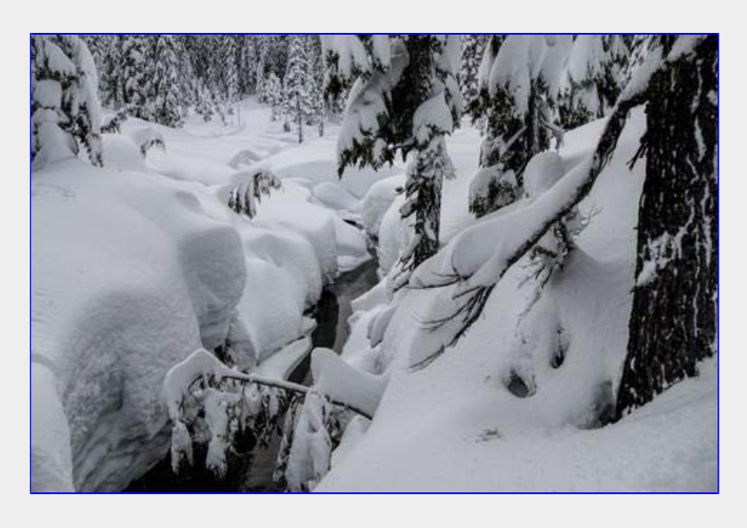
Deep snow at the bridge