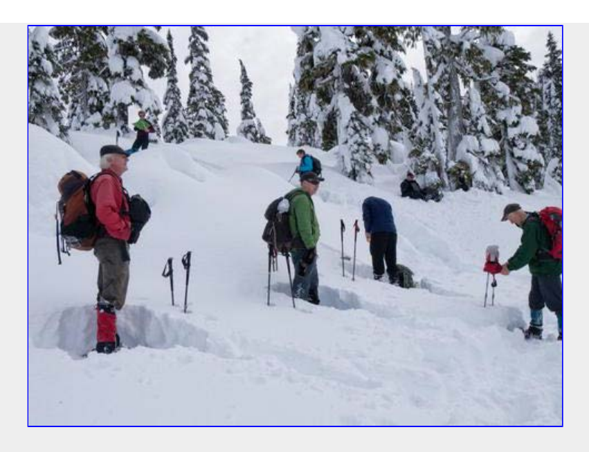
Carving out a spot for lunch at Kooso Lake