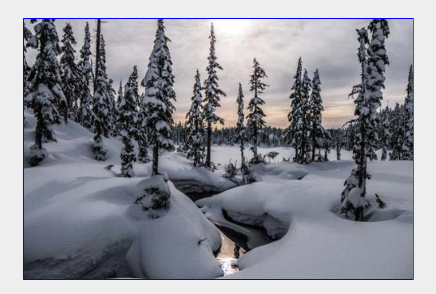
Nice lighting and pristine snow at the lake outflow