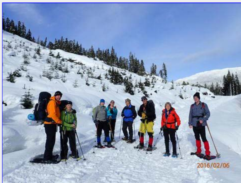
Enjoying the sunshine