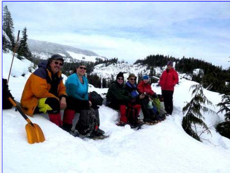
at lunch view point enjoying seating dug by our leader with shovel from co-leader