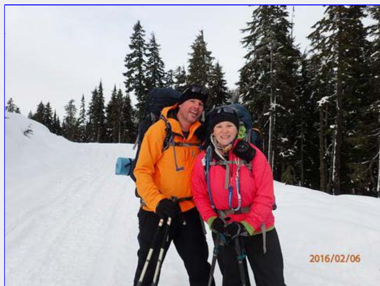
Those two are going to Douglas Lake Cabin for the night.