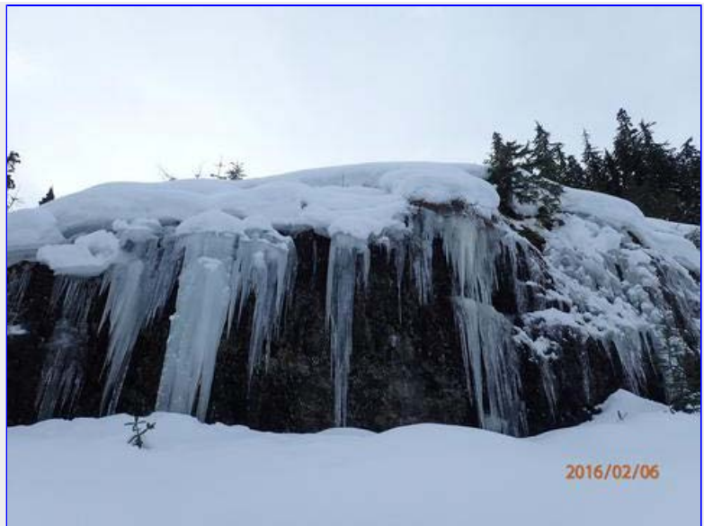
Nice and big icicles on the way