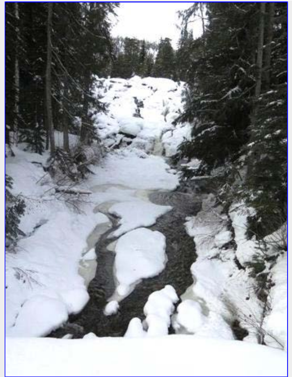
Paradise Creek