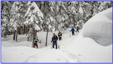
Deep snow in this area