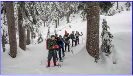
Heading out from Kooso Lake