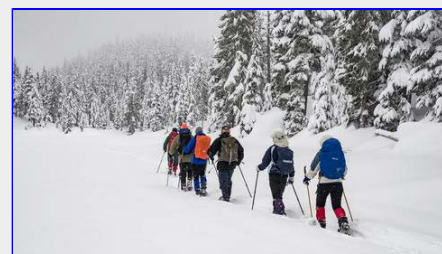
On Battleship Lake heading to Kooso Lake