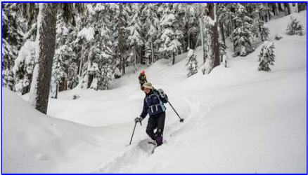
Heading down to Helen Mackenzie Lake