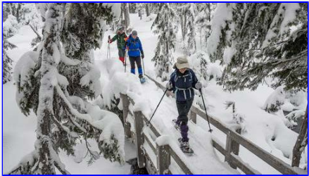
Crossing the Helen Mackenzie Lake outflow bridge