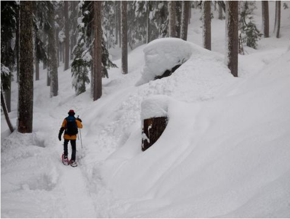
Lots of snow heading up to Battleship Lake on the summer trail