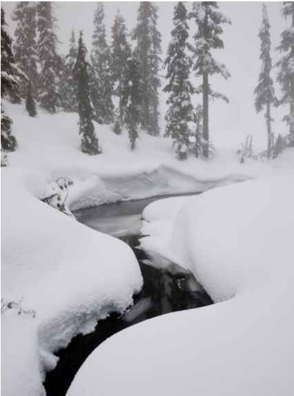
Very foggy at the north end of Battleship Lake