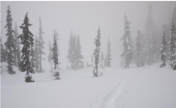
North end of Battleship Lake