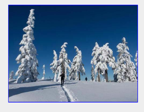
On top of Elma