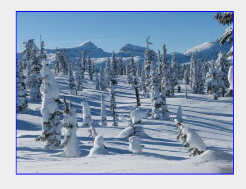
Snowy paradise