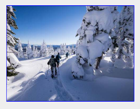
Heading towards the viewpoint