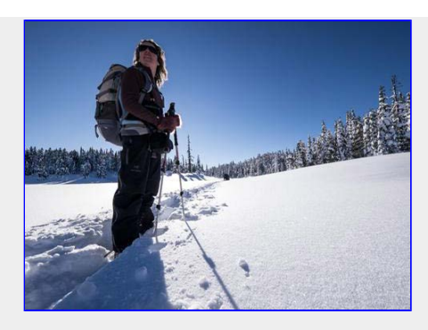
On Battleship Lake