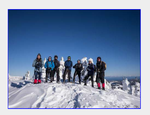
Lunch break group shot