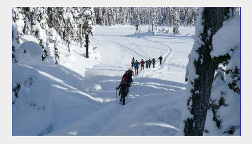
Leaving Battleship Lake on the way to Helen Mackenzie