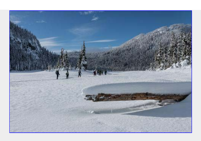
Heading to the small island for lunch break