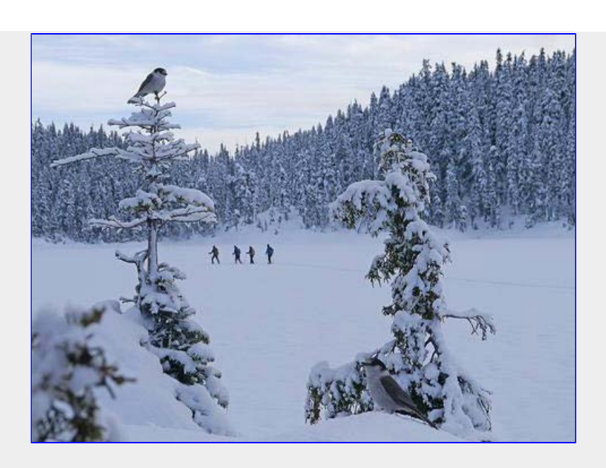
Lunch Visitors