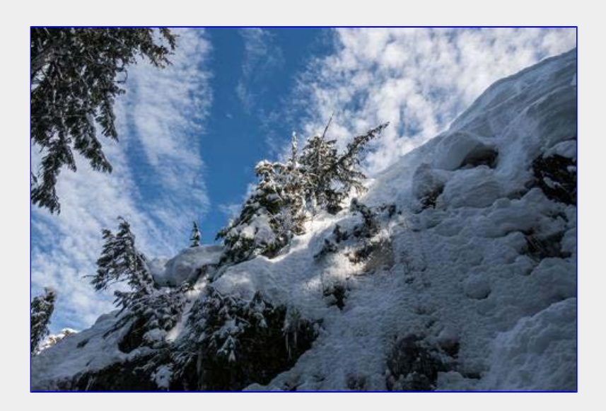
At the icicle bluff on the way back to the meadows