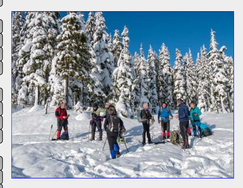
snack break at Battleship Lake

Happy to return home for a cleansing shower. We were truly blessed to have such fine weather for a mid week trudge and look forward to future similar opportunities.