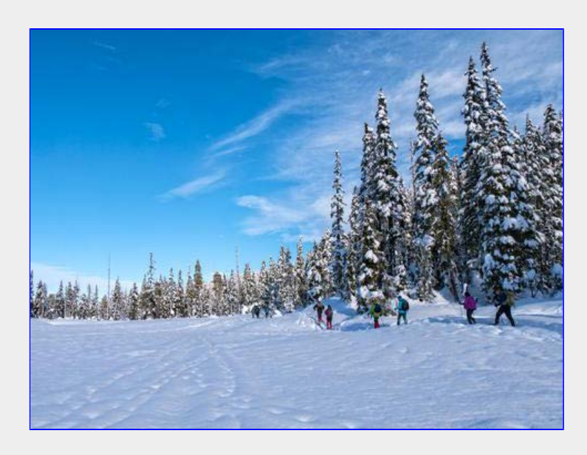
Along the edge of a summer pond