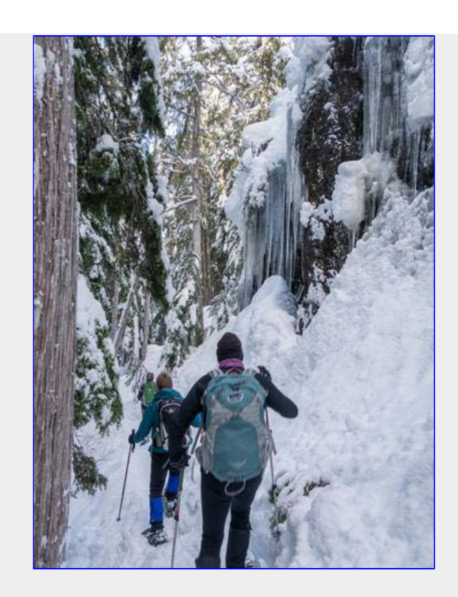
Icicle Rocks