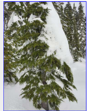
How come the icicles never looked this good on my tree at home?