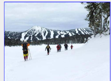
Starting to cross Lake Helen Mackenzie on the way back.