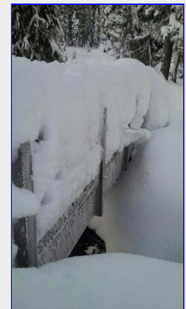
A very frozen bridge