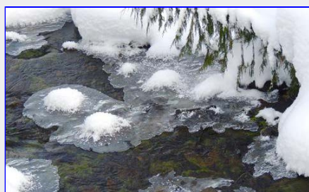
A Solid & A Liquid