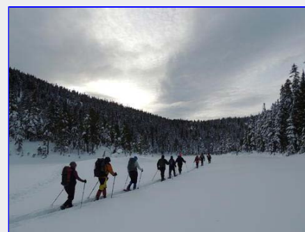
Heading to the Ranger's Cabin