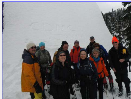
Group shot at the Rangers Cabin. Notice the "CDMC" behind us.