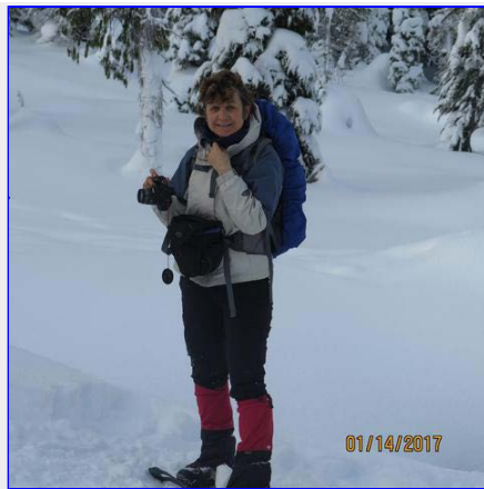
Our photographer