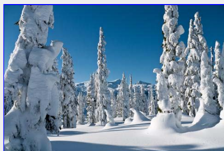
Spectacular snowy scenery