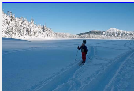
Crossing Lake Helen Mackenzie