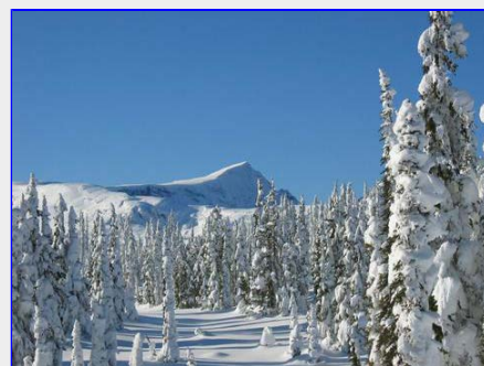
Mt Albert Edward always beckons