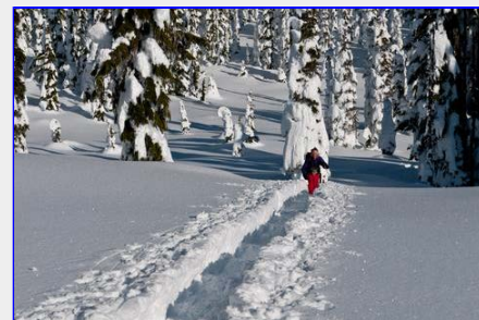
Karl stuck in the groove