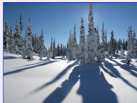
Long shadows in pristine snow