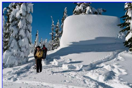
The vanishing act - Hard to see the cabin from this angle