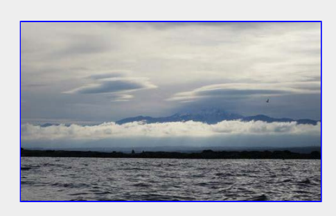
Interesting clouds over Mt Arrowsmith