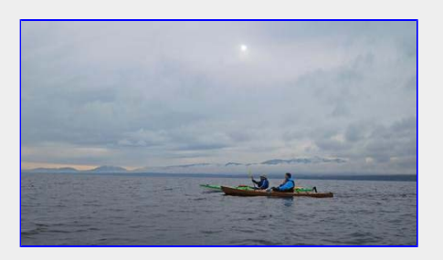
Out on the strait