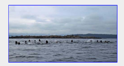
Plenty of activity