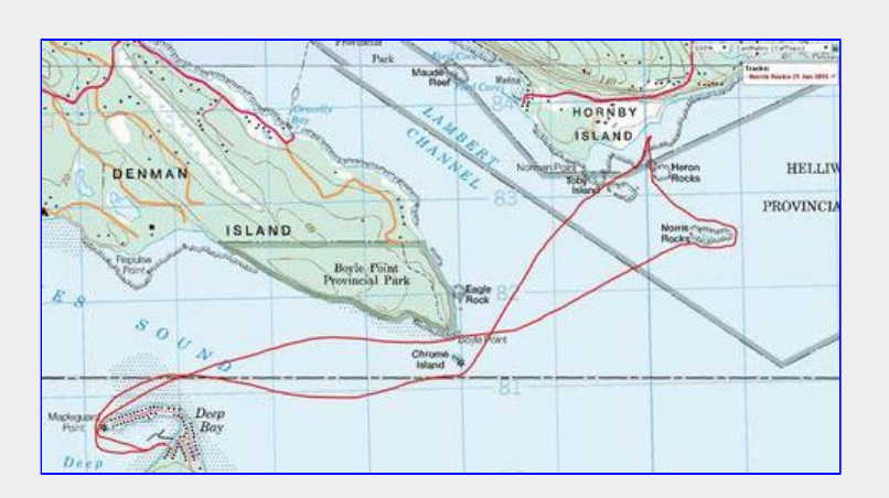
Our route overlayed on Google Maps