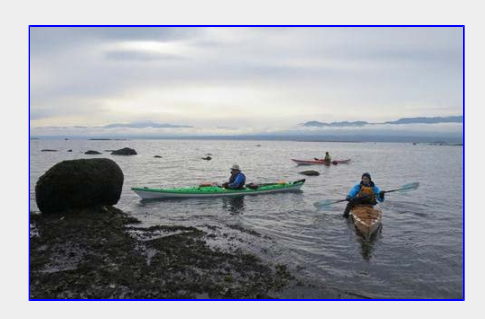
Landing on Hornby for lunch