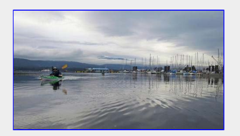
Returning to Deep Bay