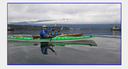
Deep Bay departure

Another fabulous day on the water....18km of paddling