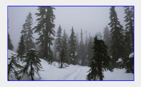
Fog and trees was the theme of the day