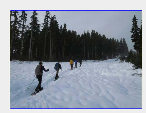
The sun came out for an instant