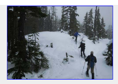
Back on the trail