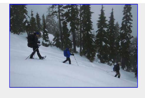
Heading down