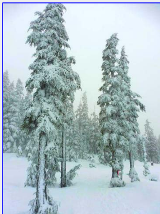
Not a lot of snow on most of the trees, must have been warm and/or windy