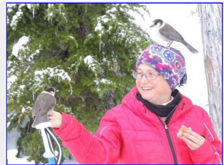
Too Much Fun