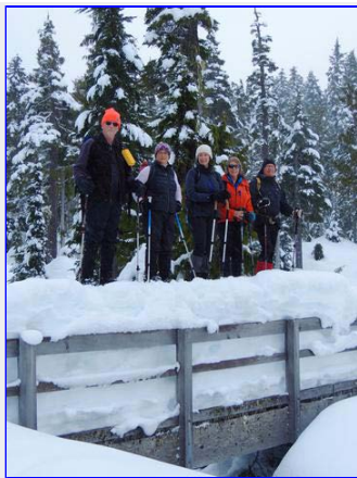
Pigott Creek Crossing