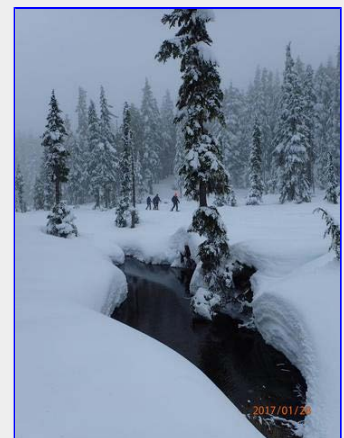
Oh, here they are coming!