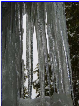
Sculptor: Mother Nature