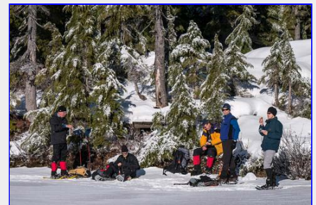
Lunch break on Kwai Lake