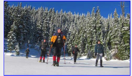
Arriving on Kwai lake