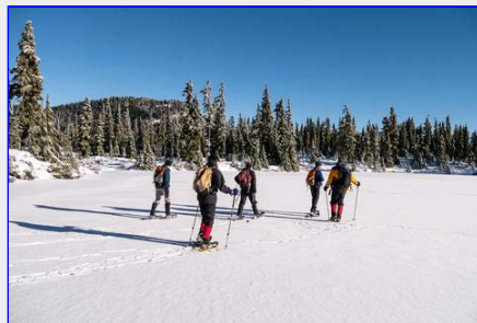
Making fresh tracks on Kwai Lake