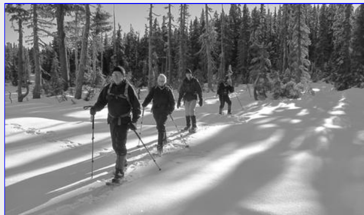
The group on Lady lake