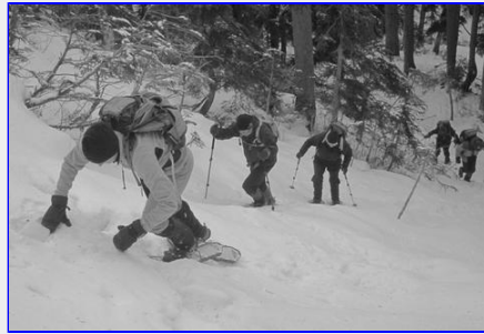
A steep pitch