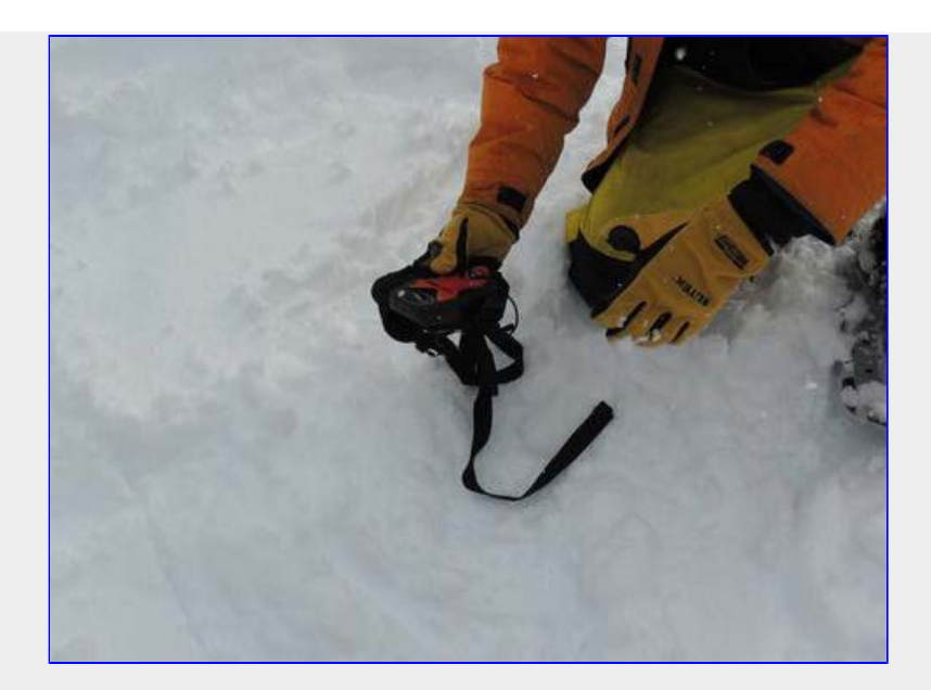
Learning to use rescue beacons...