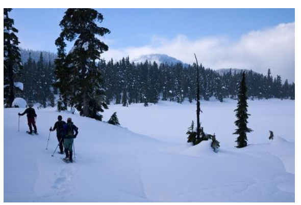
Lunch stop at the Southeast end of Battleship Lake