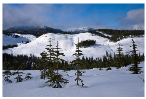
Heading towards Paradise Creek - Mount Elma & Allan Brooks in the background