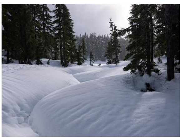
Creek outfall at the North end of Kooso Lake