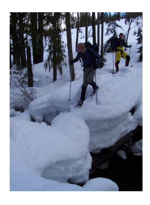
Crossing Paradise Creek