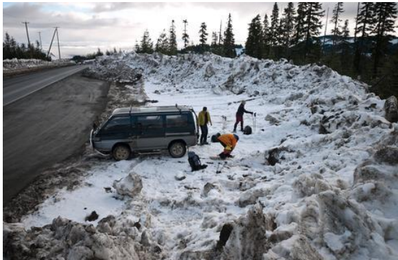
Starting point at Km 13 on Strathcona Parkway