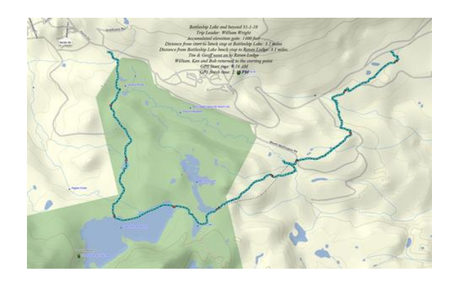
GPS Map