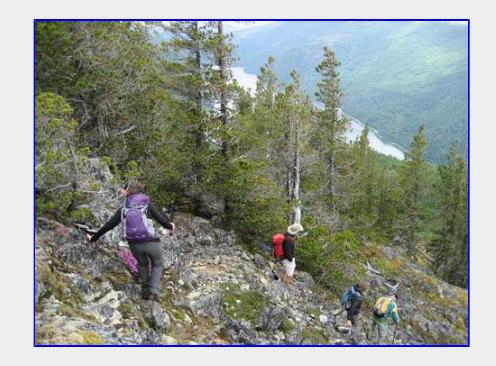
Heading down