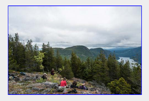
Lunchbreak lookout to Mount Wesley and Cameron Lake