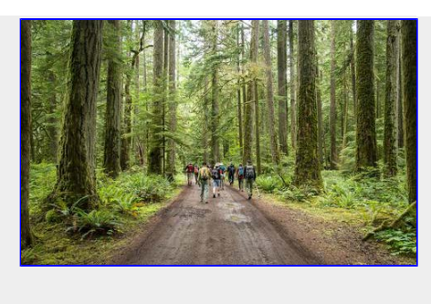
Start of the trail