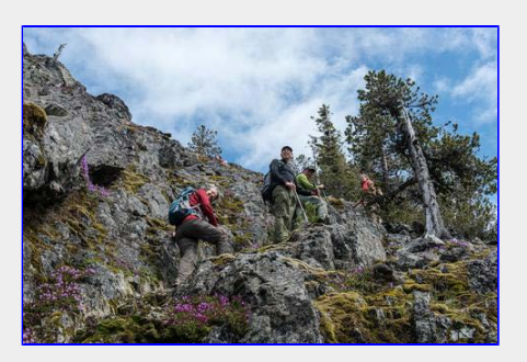
Rocky climb just below the summit