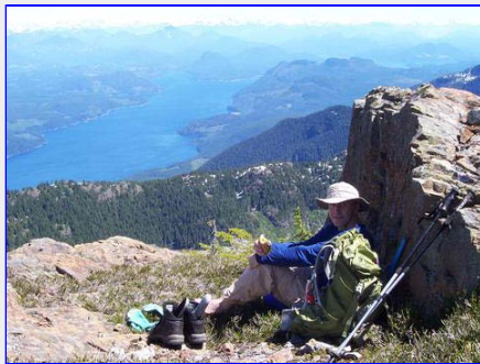
Lazy Hazy Days of Summer