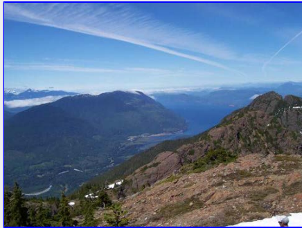
H'Kusam Overlooks Kelsey Bay