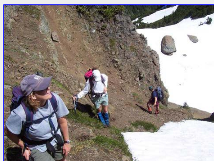
Ice-axes Deployed on Steep Pitch