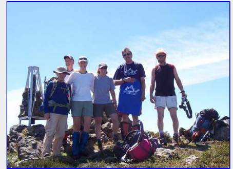
A Sense of Accomplishment