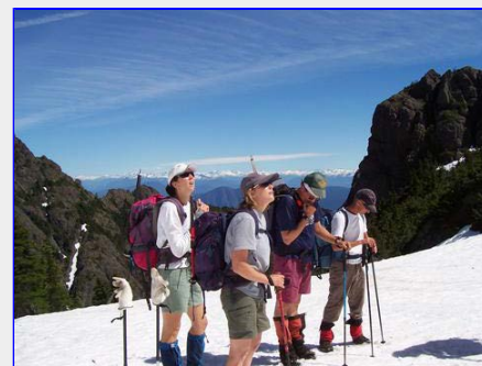
We have to go Where?