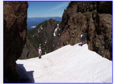
Snow Ramp onto Summit