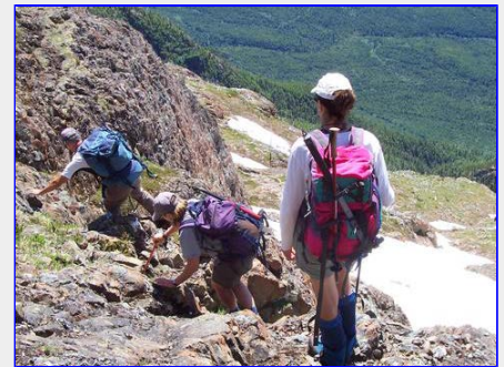
Heading Home