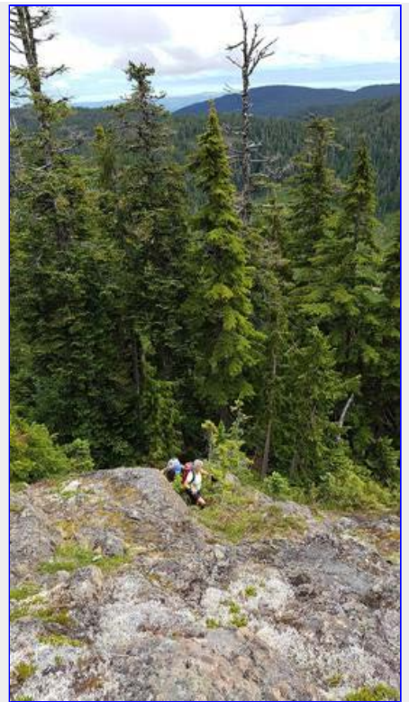
heading up the bluffs to the summit