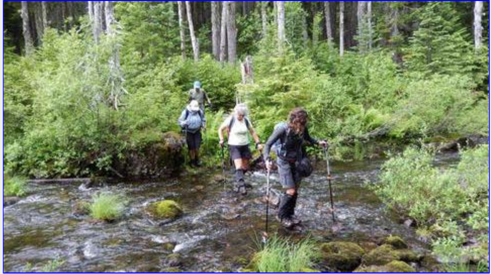
Crossing the Mckenzie Lake outflow