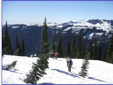
Carey Lakes Ridge to the south