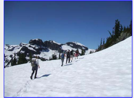
King George V to the west