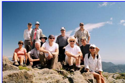
Group summit shot