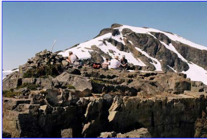
Mt Frink