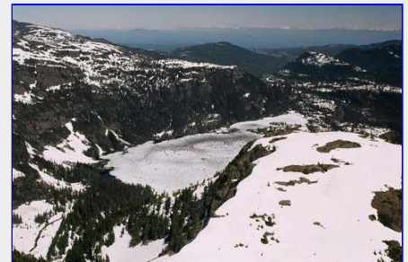
Moat Lake showing circular patterns