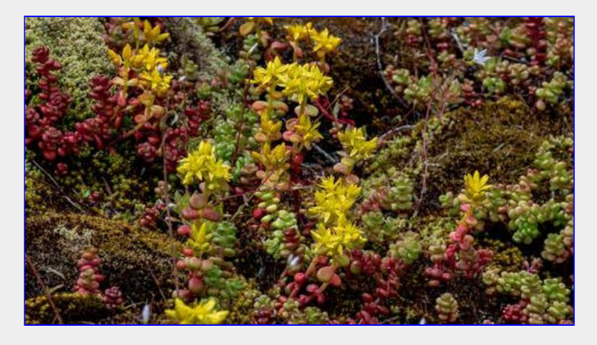
Sedum divergens - Spreading Stonecrop