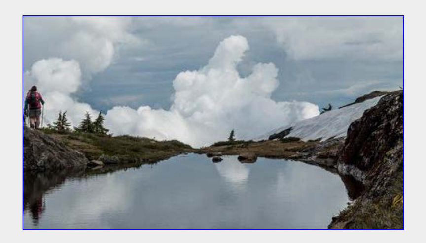
Infinity pond near the summit