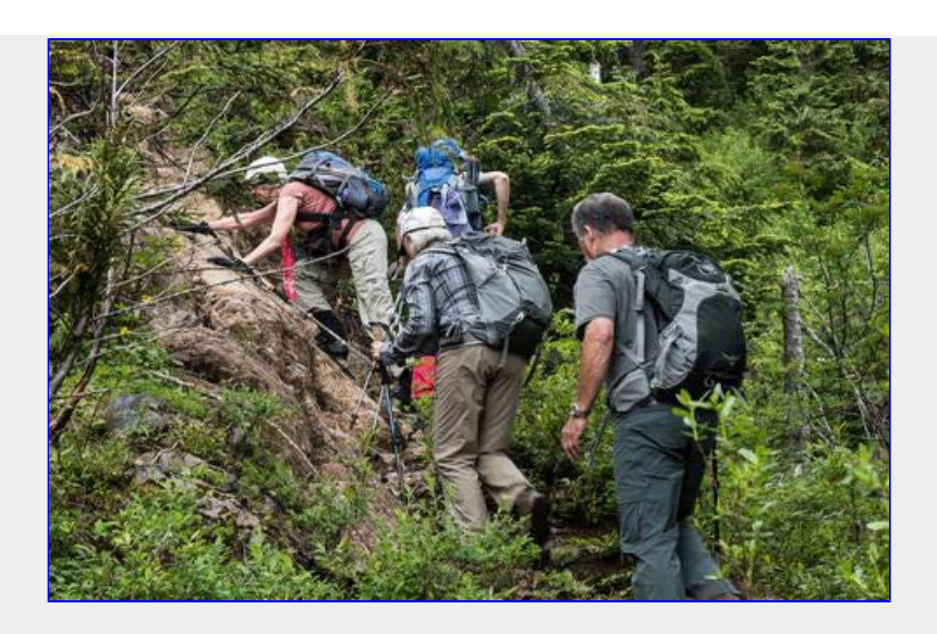
One of the rocky sections