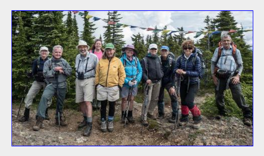
Photoshopped group shot