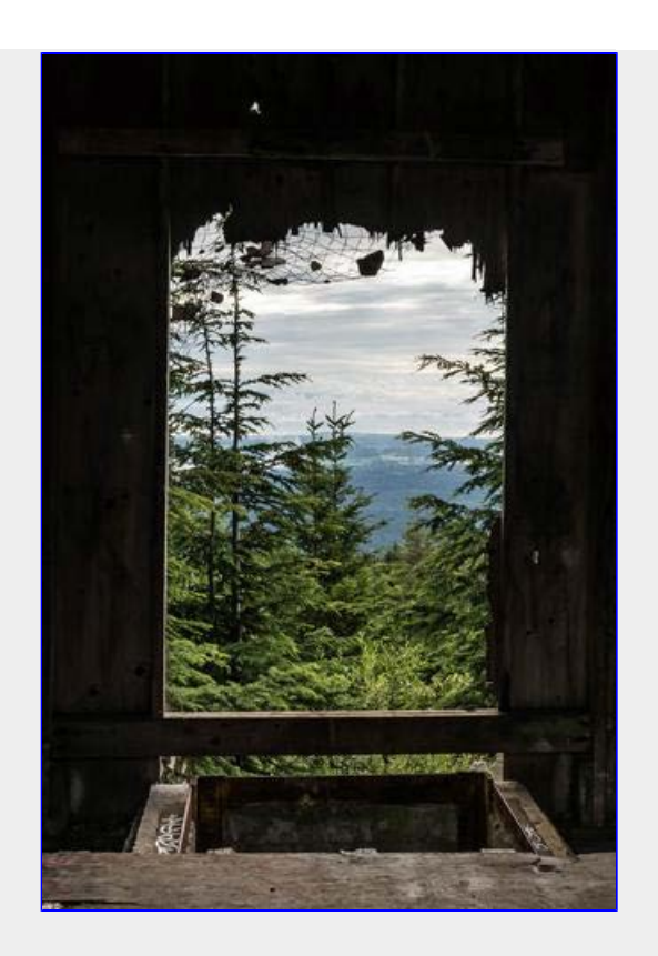
Framed view