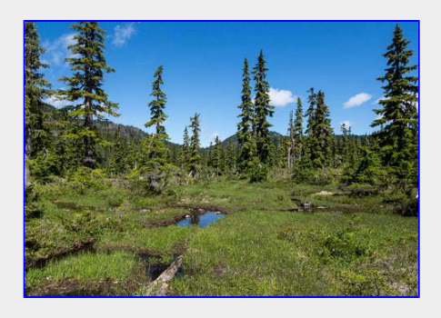
Grassy area above John Brown Lake