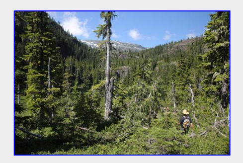
Into the bush with the objective, the Moat Lake moat, in the distance