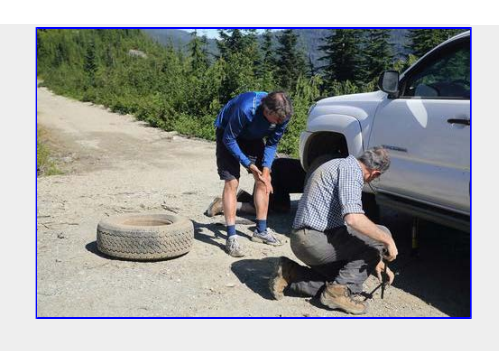
At the trail head