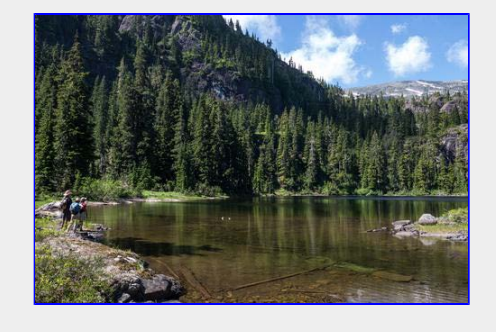
John Brown Lake looking towards the Moat Lake ridge