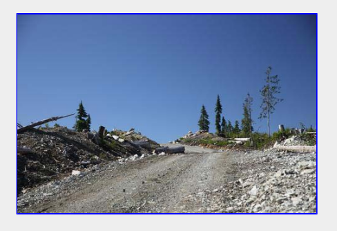
The end of the road