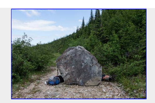
No first aid required