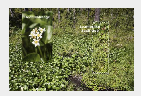
Some bog plants in the fen below John Brown Lake