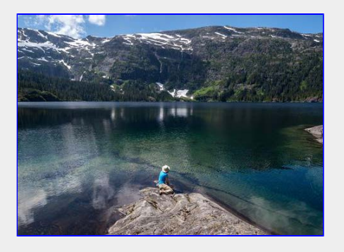
Beautiful colours at Moat Lake