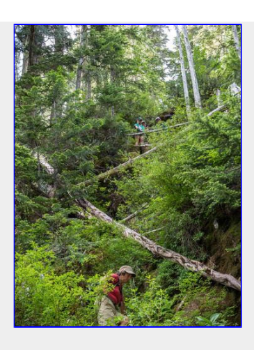
One of the fun sections