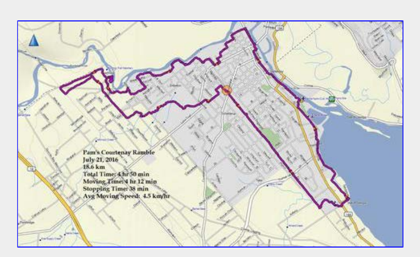
GPS street route view