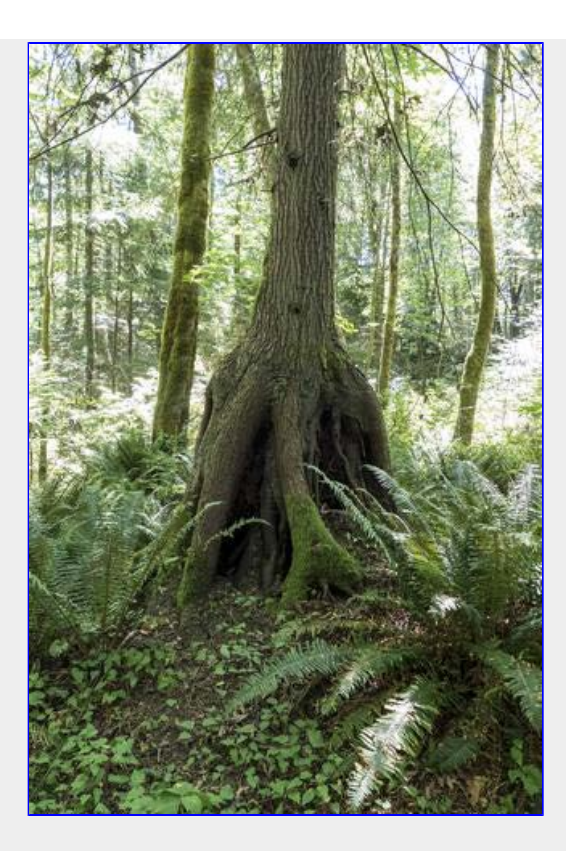
Life will find a way, Morrison Creek Greenway