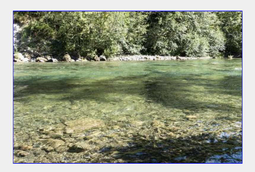
The Puntledge River at rest