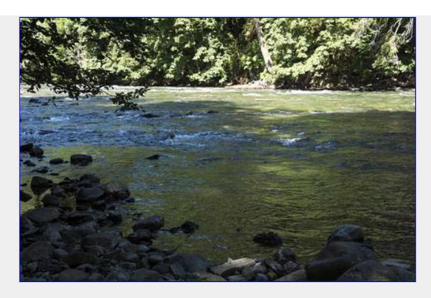
The Puntledge River on the move