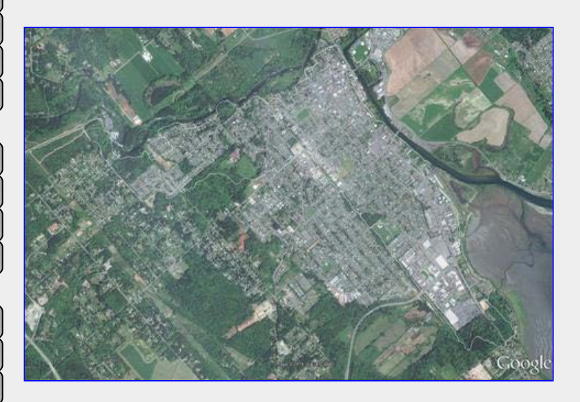
Urban Rail & River Ramble Route= 18.6 km

This ramble turned out to be a bit more than the leader had planned, 18.6 km. in total. However the good group that we had was up for the distance and the changes. We basically did a big circle route of southwest Courtenay beginning and ending at the train station. We walked on the Rotary rail trail, Millard Piercy nature park, Courtenay Air Park, city streets, Puntledge Park, the fish hatchery and Morrison Creek Park. A lovely sunny day with enough shade cover to keep us cool.