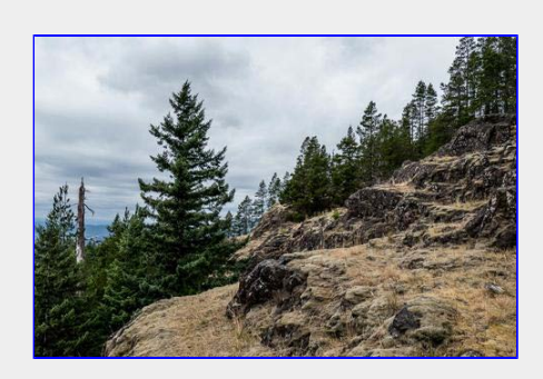
Exceedingly dry conditions with little in the way of flowers or green grasses