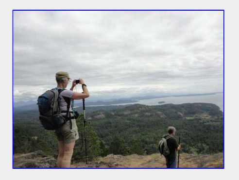
Beautiful panoramic view from the summit of Chinese Mountain south peak