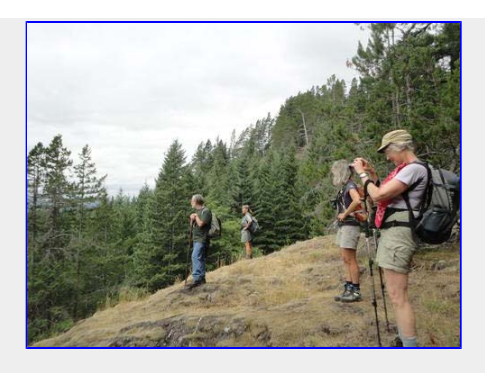
Taking in the view on our way up Beech's Mountain