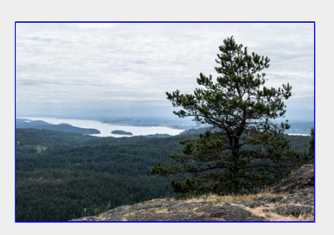
View from Chinese Mountain south summit