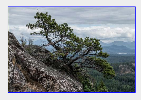
Bonsai style trees on the summit rocks