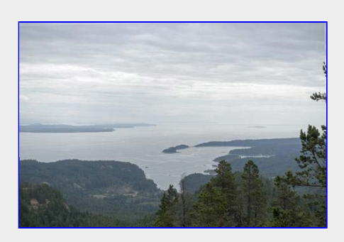
View of Rebecca Spit and Strait of Georgia from South Chinese Mountain