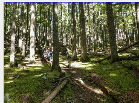
A nice walk through the woods