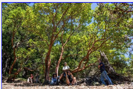
Relaxing in the shade of the beautiful arbutus trees