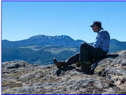
Mt Arrowsmith without its snow