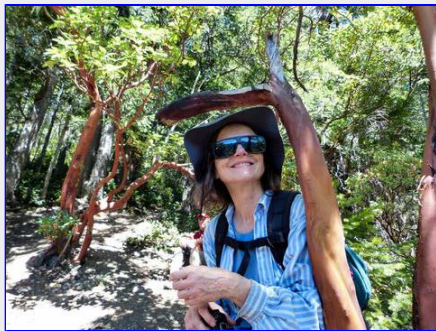
Loving the arbutus