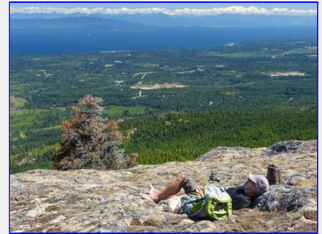
Relaxing at the summit