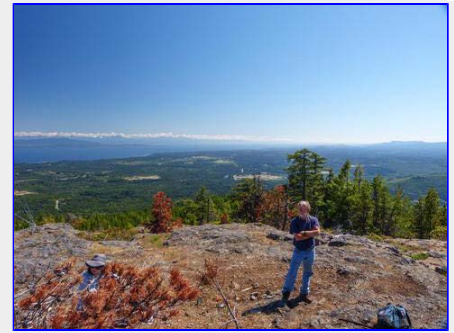
The first lunch stop