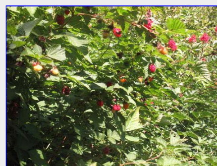
Salmon berries & Elder berries