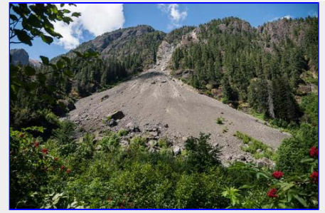
Rock slide area