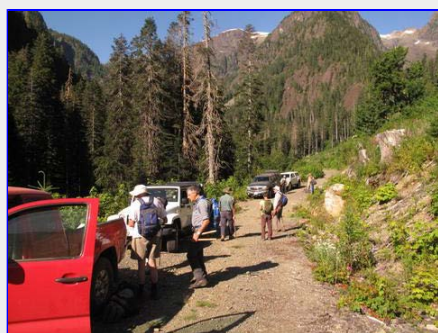
Gathering at the trail head

We had an excellent turnout for the work party today with 12 avid workers meeting at the court house. This really made the work load easier and quicker to accomplish. One group of 8 headed up to the second slide area which was completed by noon while Ken with the brush cutter and three others clipping completed the first slide section. An abundance of super sweet salmon berries quenched our thirst along the route. We finished up at 2:30 back at the vehicles. Last year with only a few volunteers the same task finished up at 6:00. Thanks to all who came out to help. We all look forward now to an easier hike in to Century Sam Lake next Sunday.