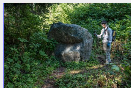
Large rock that fell onto the trail from the ridge above the road.