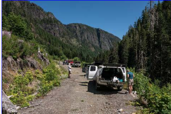
Clearing completed and back to the vehicles by 2:30