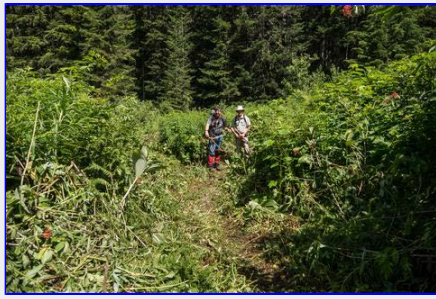
On a well cleared trail as we are heading back to the vehicles