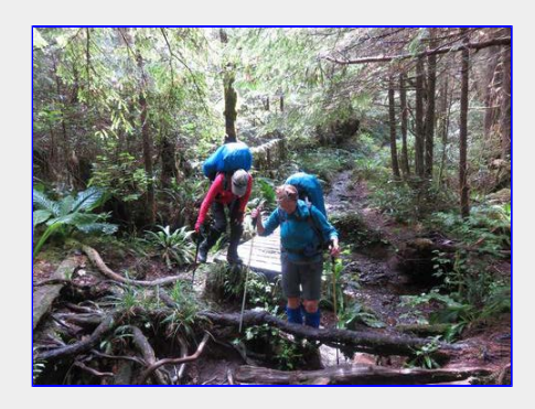
Making our way to Nels Bight