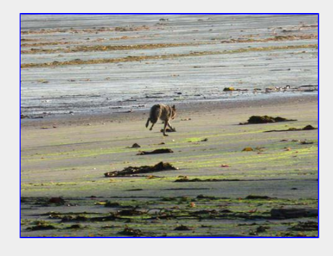
wolf running