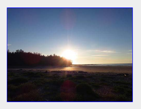
Sunset Thursday