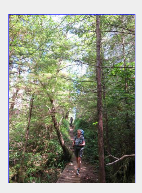
Almost there!