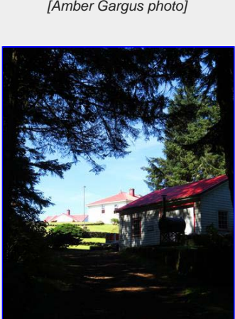
Cape Scott Lighthouse