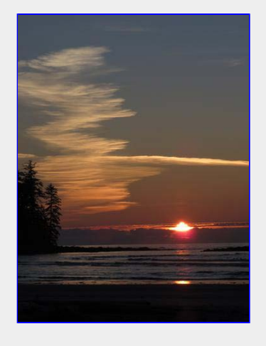
Wednesday Sunset