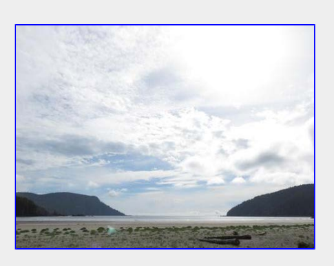
San Josef Bay