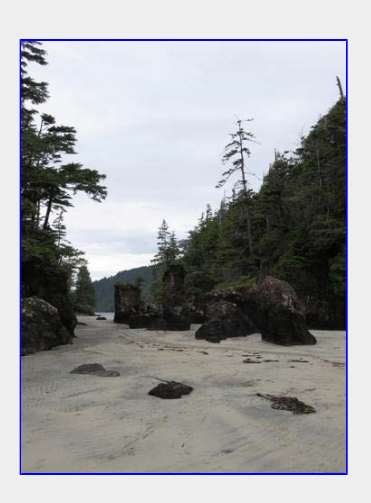
Sea Stacks