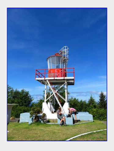
lunch break