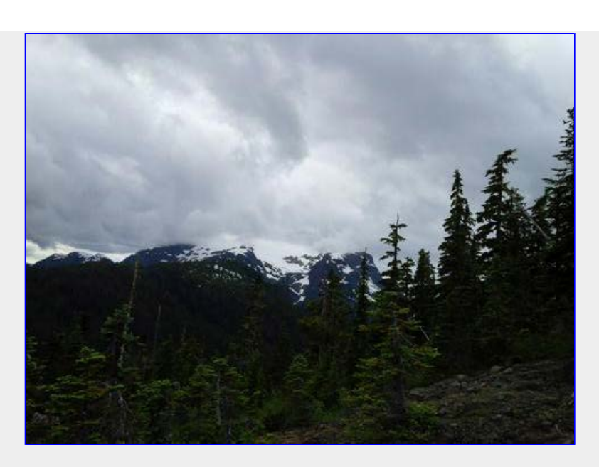
[Juanita Wells photo]