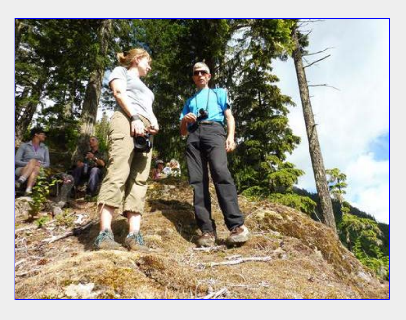
Even the rest areas were steep!