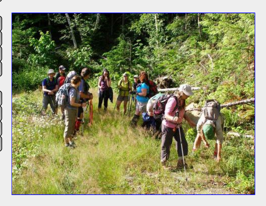
Just started our hike

Thanks to the members who cleared some of the trail going up and down. We put in some new trail markers along the route into Capes Lake Thanks Glen.!! Arriving back at the trucks, with some of the members looking very tired but happy. Somewhere in between 10 and 11 km round trip. 27 kms from the Court House to the Trail Head parking. Driving back along the road, we stayed as a group until the Court House. A good day by all. Thanks members, great day.