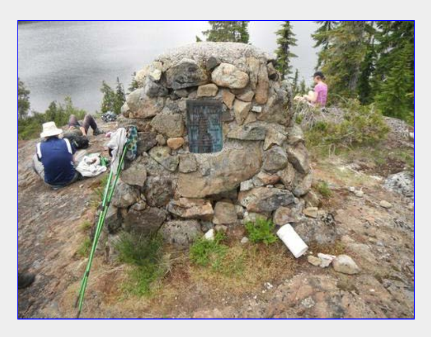
Lunch break around the cairn.