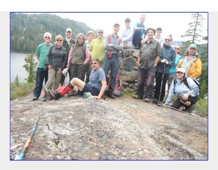
The 2016 members photo around the cairn.