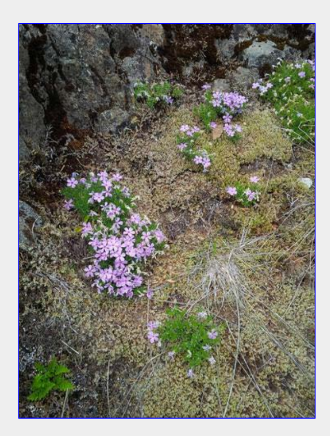
[Juanita Wells photo]