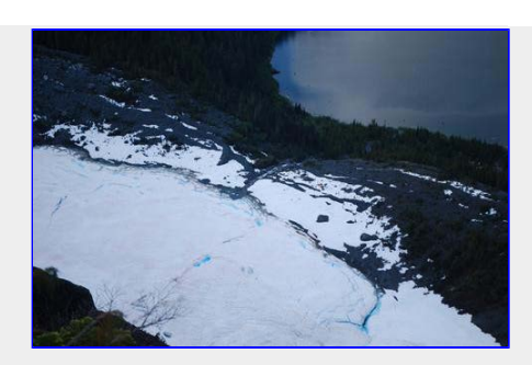
Camp way down there