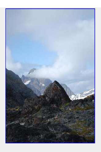
SE Col looking at Elkhorn