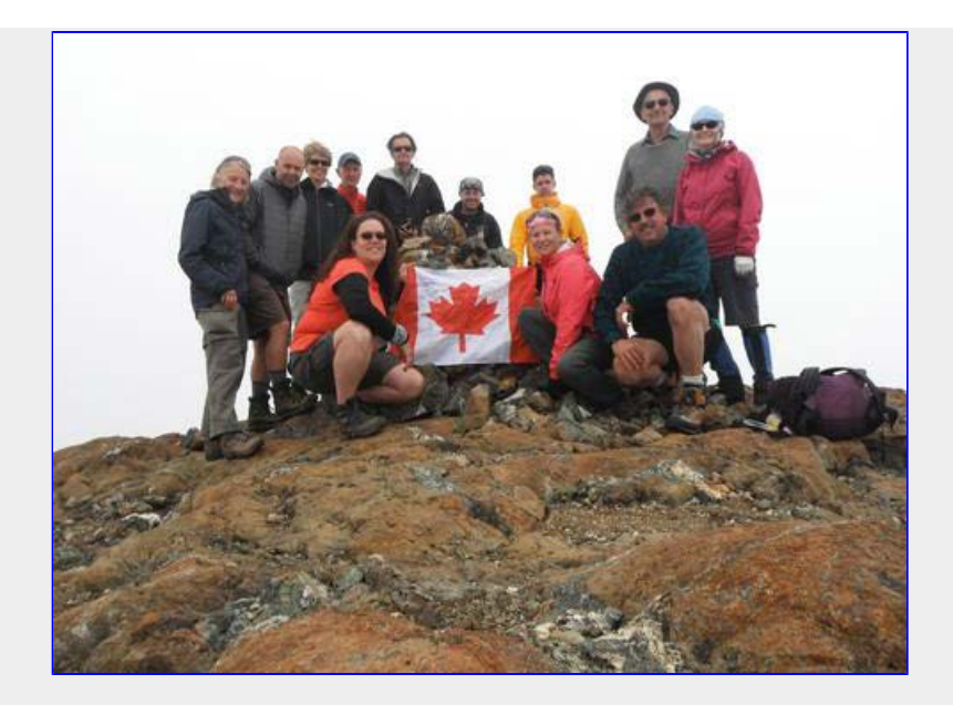
Another group shot with our flag at the South Summit.