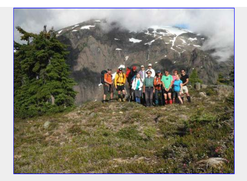
Monday morning group picture, with the clouds on the glacier.