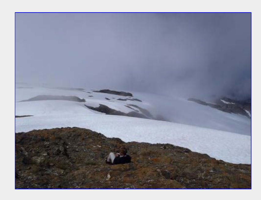
Peak a boo views to the north summit.