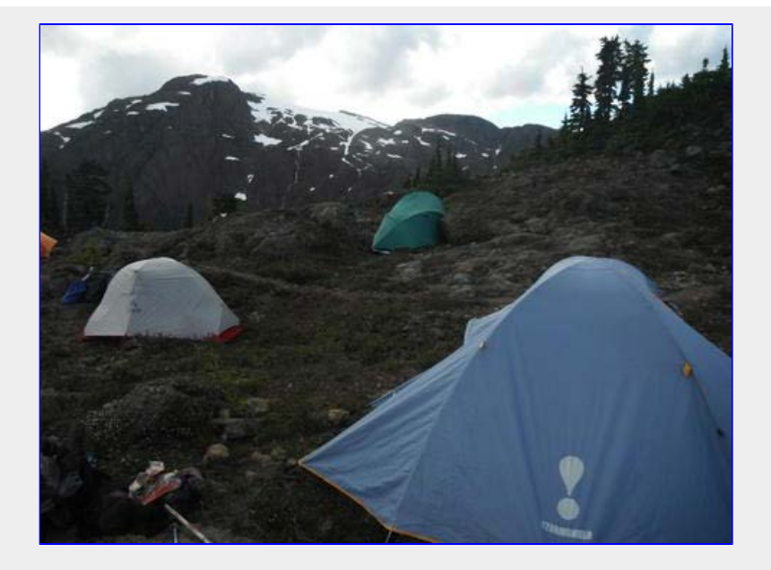
Tenting area, with the glacier in the background.