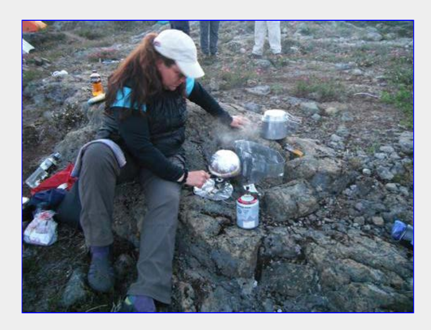
Anybody up for some Jiffy Popcorn ? yes, it tasted good !!! :)