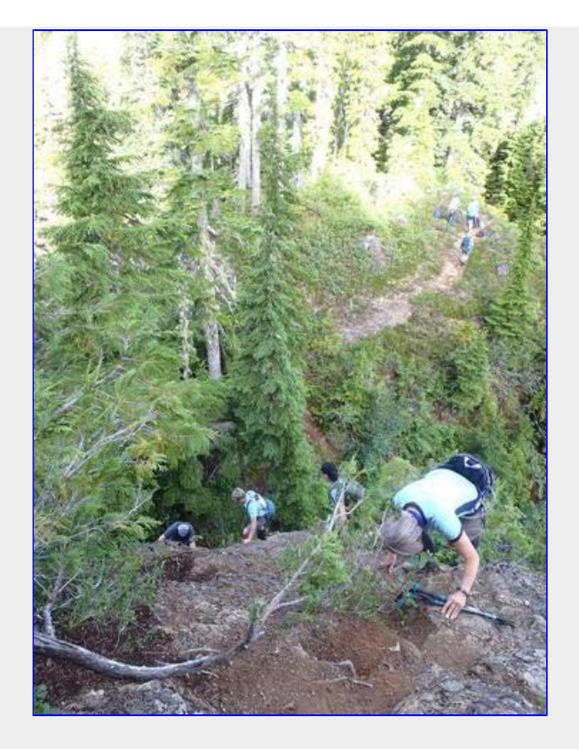
And we thought it was all up to the Glacier, Iol!