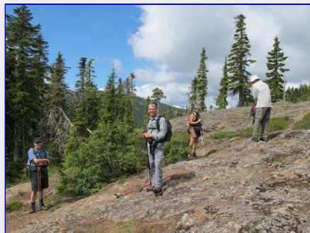
Almost there