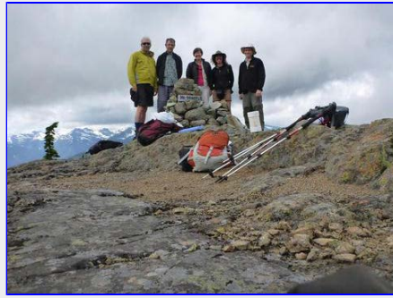
Proof of making the summit!