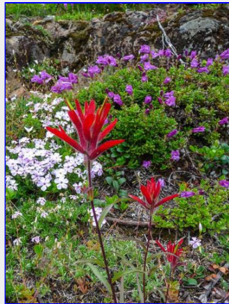
Beautiful array of alpine flowers