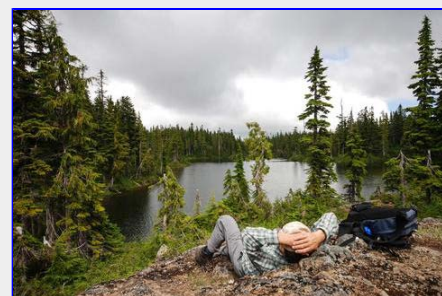
Relaxing by the lake