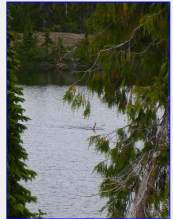
Going down for the last time!