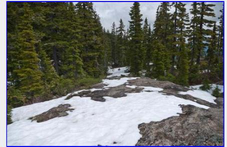
Still some snow on the trail just before Capes Lake