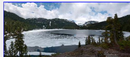
Capes Lake panorama shot