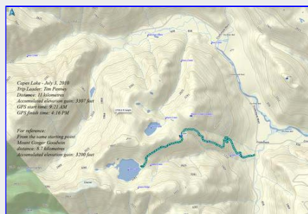
GPS Map