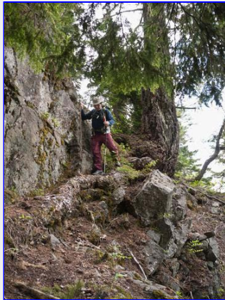
One tricky section on the trail. The rope assists in the navigation