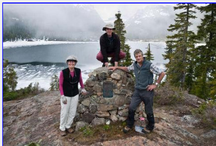
The 1964 cairn for Geoff Capes