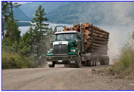
The reason that we have to use the radios on the logging road