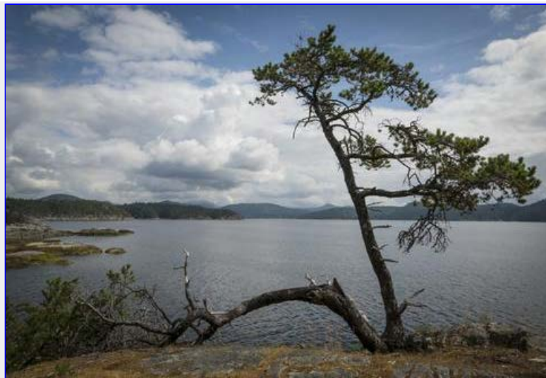
View thru old trees of Read Island