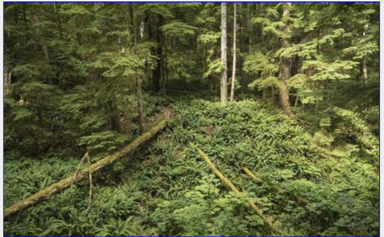
Ferns and Forest