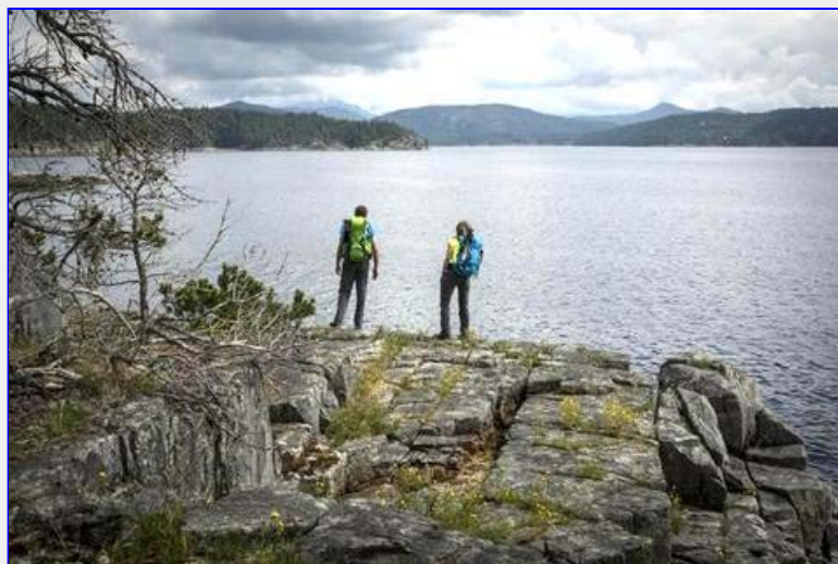
Colour co-ordinated hikers enjoying the view

Our moderate 10 K ramble ended up as a 15 K adventure ! 14 hikers started off enjoying the great views from the cliffs above Shellaligan Pass. We could see the Breton Islands, Read Island and Cortez. After a pleasant lunch stop on the beach facing Village Bay we climbed up from the coast through good looking second growth forest. We obeyed the trail sign as we emerged from the forest and followed a logging road which we thought led back to the cars. Somehow we missed another turning and ended up on Village Bay Road with a 5 K walk back to the cars. In retrospect a more detailed map and having the walkie talkie radios would have been a help. Eventually all was well, the cars found and we had time for the traditional ice cream stop at Hyacinth Bay Road in Heriot Bay.