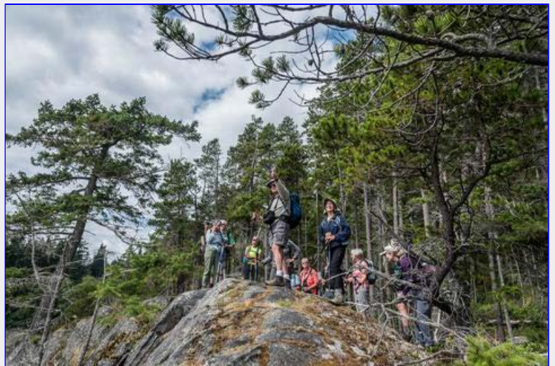
On the rocks!