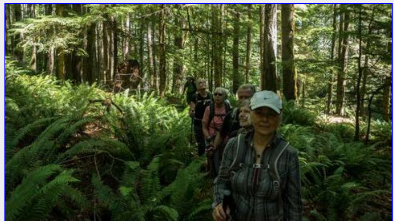
Still in the woods