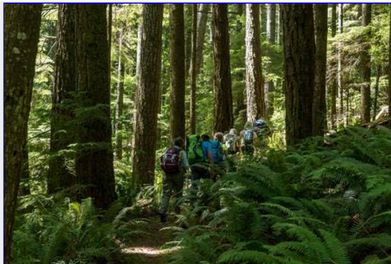
Deep green in the ferns and trees