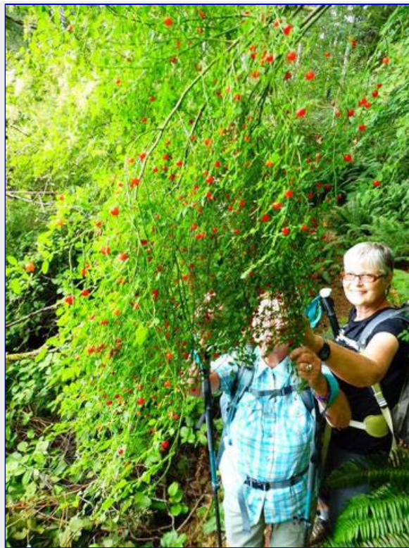
The huckleberries were just too good to pass up