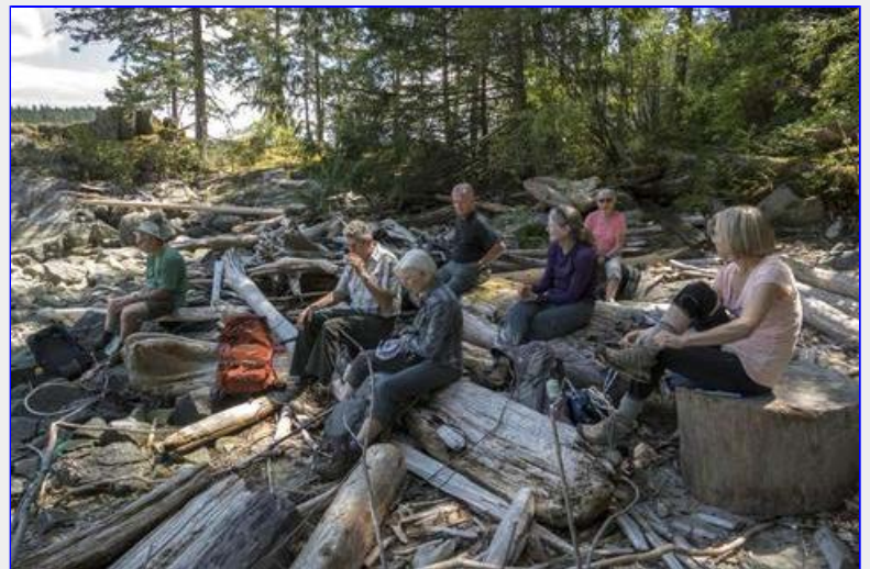
Lunch time.